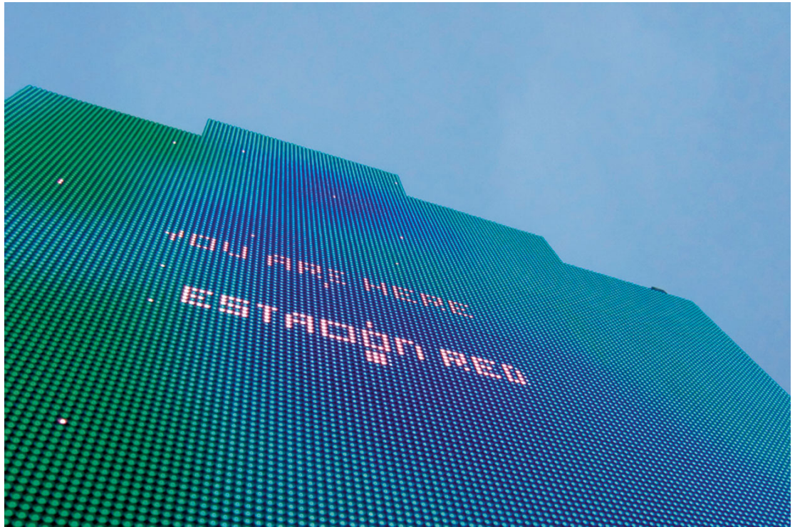
Digital façade application. Medialab-Prado, 2009.

This text aims to question some of the aspects of Madrid's aerial ecosystem through the project In the Air . By visualizing the substances in the air as non-human, invisible agents, it sets out to identify their physical, social and political relation to the urban environment, with effects ranging from the interior of the human body to the image of the city. Visibility of this symmetrical relationship between humans and non humans makes it possible to shed light on its controversies and to include these in the social political debate.