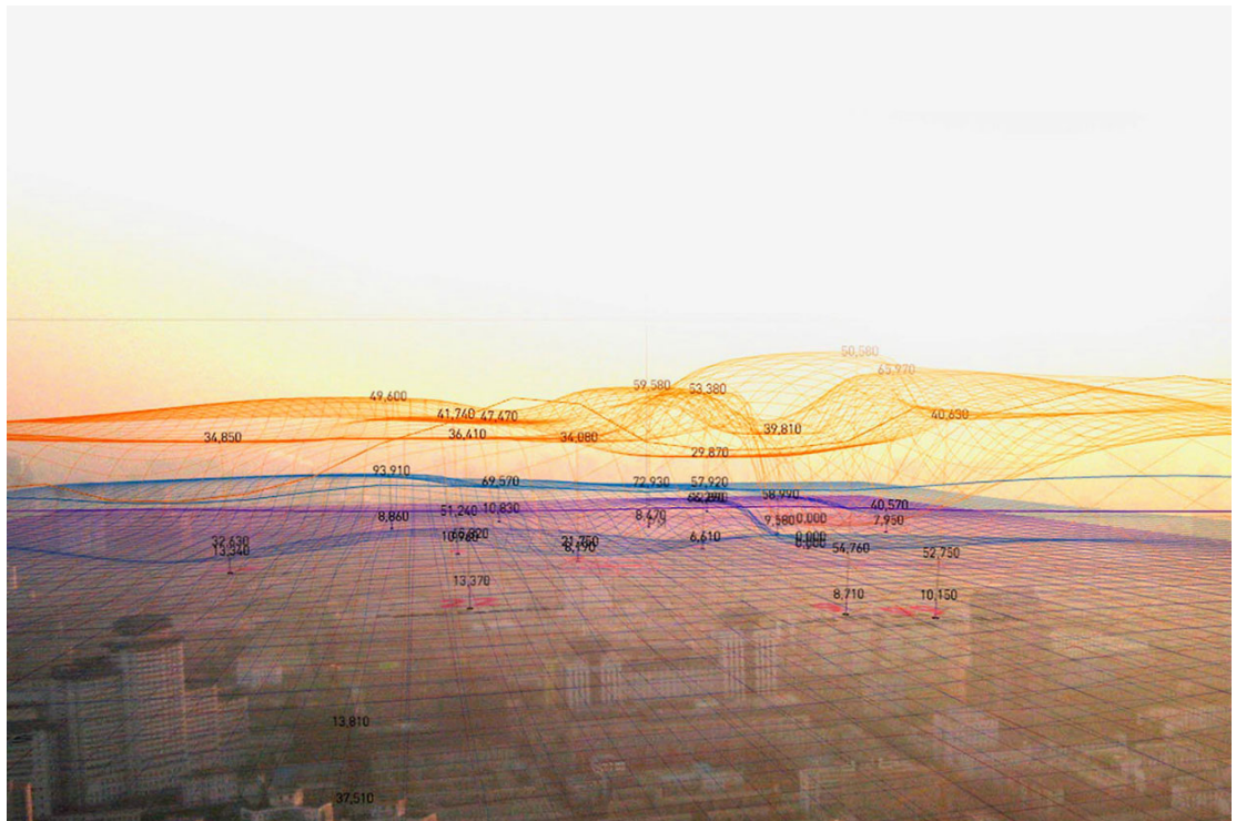
Madrid in the Air I and II, 2008 and 2009.

With the project In the Air , 1 Spanish architect Nerea Calvillo wants to make the citizens of Madrid more aware of the city's official monitoring systems for measuring air pollution and get them involved. Through the development of interfaces, collective action can be initiated that is aimed at exchanging experiences and raising community consciousness.