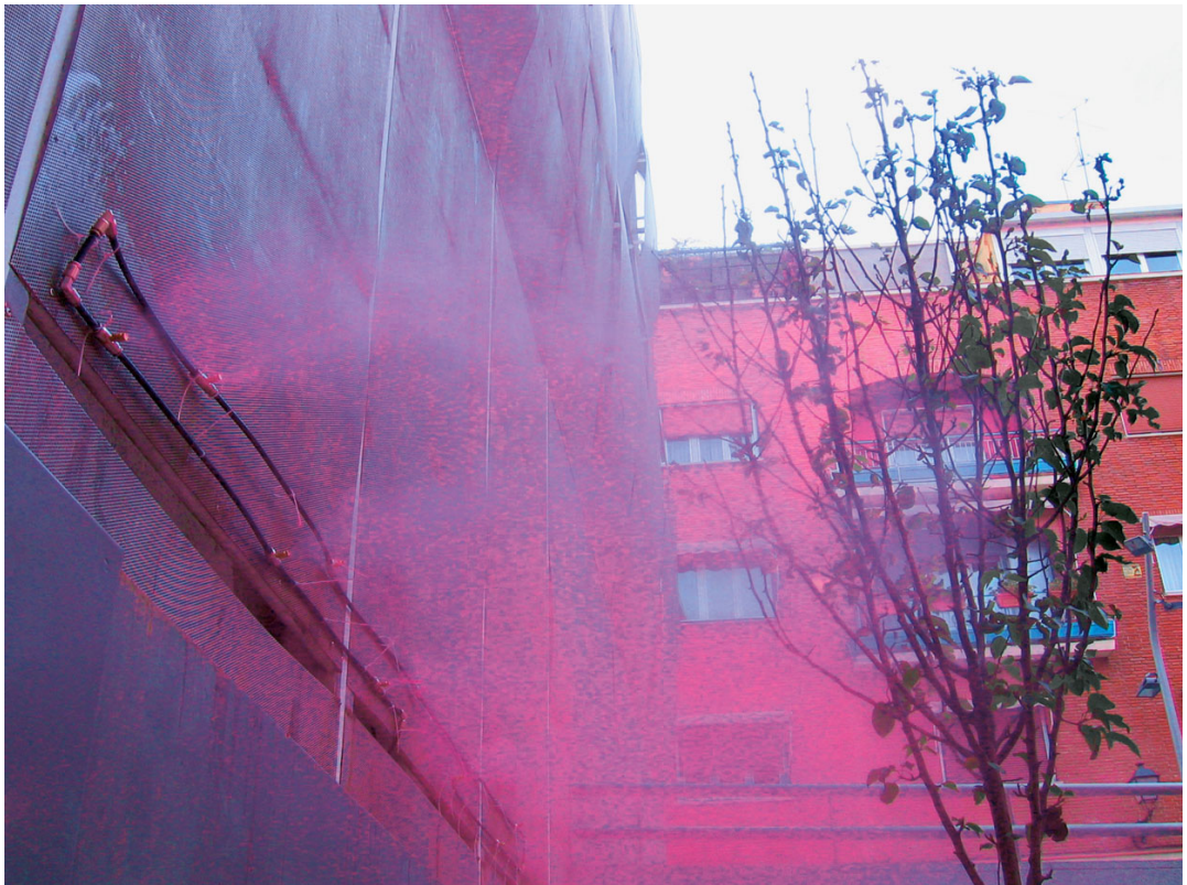
Diffused façade prototype during the day, revealing the density of SO 2 measured in the closest measuring station.

In parallel, the project proposes another way of participation when it comes to data production. A domestic detector-visualizer kit is being developed that citizens will be able to assemble and put on their balconies or rooftops. On the one hand this would allow the production of data on a larger scale, increasing the resolution of the mesh. On the other hand the production of independent data would make it possible to make comparisons with official data, to ensure political transparency and to measure air quality at strategic