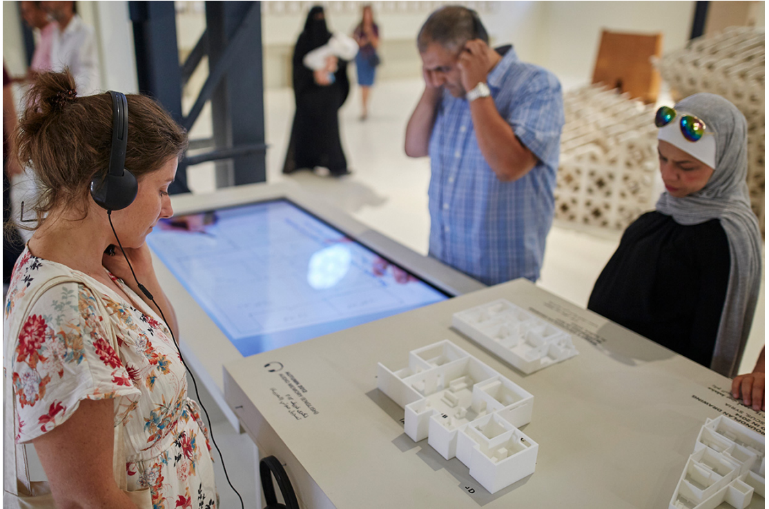
“Groundplan Drawings” video, models and publication on display at the Amman Design Week in October 2019.