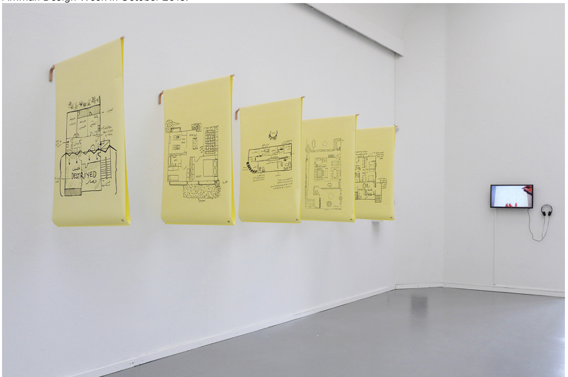
“Groundplan Drawings” video and drawings on display in Amsterdam.

For Simba, the Last Prince of Ba'ath Country (2011), we sourced political imagery related to the Syrian conflict from social media platforms. Specifically we looked on Facebook for pro-Assad propaganda made by pro-regime fans. Then we used the format of a publication to analyse, deconstruct and contextualise the visual iconography and the construction of myth within the images as a way to understand the Syrian conflict as it was unfolding and to capture a specific moment in time. Much of the found digital material is no longer available on the internet, highlighting the importance of our compilation and contextualisation of events as they were taking place.