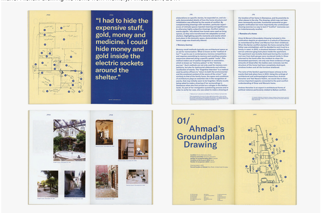
"Groundplan Drawings" spreads from publication, 2019.