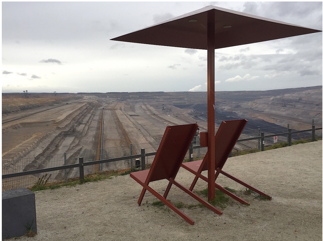
Terra-Nova, viewpoint, Elsdorf, Germany.