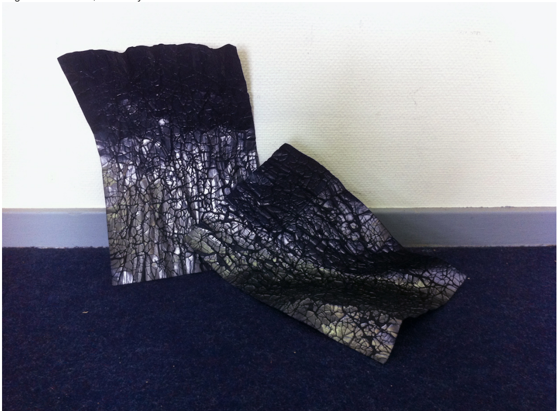
The future depends only on the current situation , 2019, graphite on paper, each 29,7 x 21 cm.

Much of the ecological crisis is a failure of the imagination. The consequences of human impact on the environmental are largely incremental, and often remain invisible. I have been exploring graphite rubbings as a new method that reveals something otherwise invisible. The graphite captures the impression of an underlying object combining presence and absence. The drawing remains, while the form that generates the image is missing.