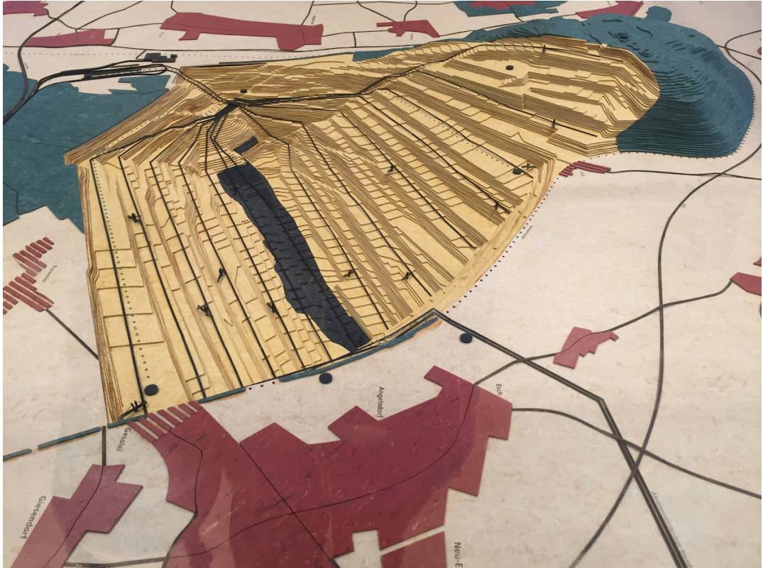
Model of Tagebau Hambach, from RWE Power's exhibit on the excavation and utilization of lignite coal, at Paffendorf Castle in Bergheim, Germany.

Despite the overwhelming nature of the ecological crisis, my initial reaction when confronted with an open-pit coal mine – surely one of the most physical and visceral symbols of climate change – was, I must admit, to be somewhat underwhelmed . Thinking about the relationship between the mark-making of drawing and mining had led me one cold, rainy week in November 2018 to Western Europe's largest open-pit coal mine, near Cologne in Germany. This mine, the Tagebau Hambach, is one of a number of lignite (brown coal) mines in the area. It supplies fuel to the second and third worst polluters on Climate Action Network's 'Dirty Thirty' list of the top CO 2 -emitting power plants in Europe. 2