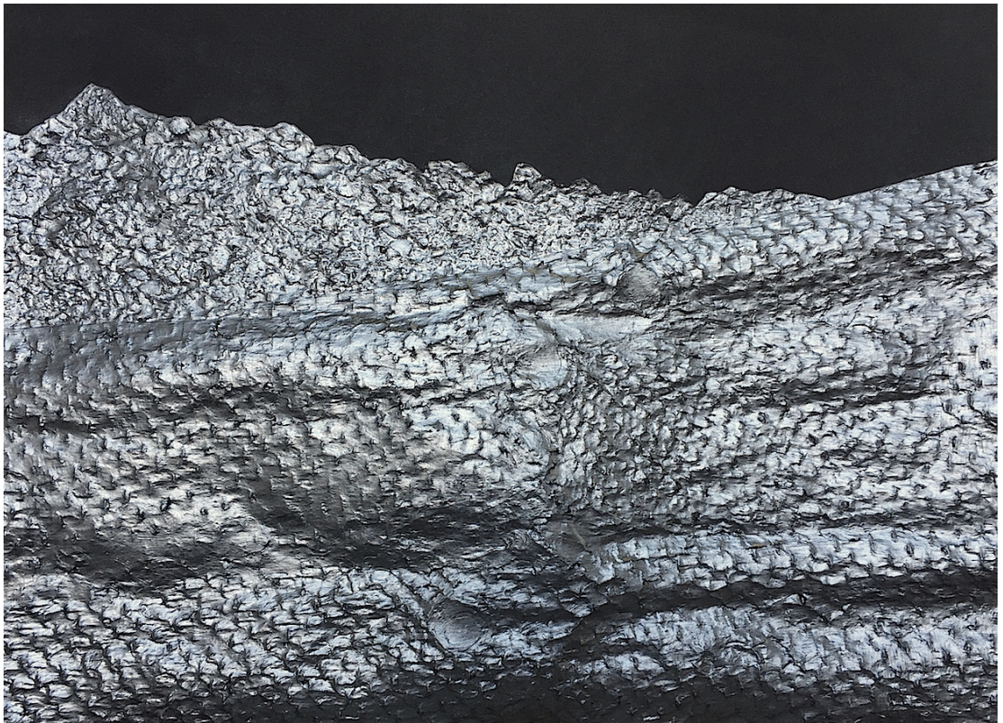
Landfillscape , 2018, graphite on paper, 35 x 50 cm.