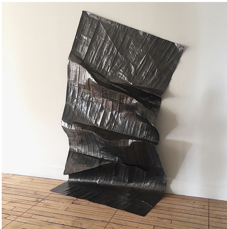
Slump , 2018, graphite on paper, 232 x 124 cm.

As Morton makes clear, one of the effects of the disorienting time we are in is an increased intimacy with the things surrounding us. And as an artist I strongly identify with the practice of having an intimate relationship with nonhumans. I often ‘make’ drawings; a kind of material drawing, hovering in between the second and third dimension, often with graphite on crumpled paper. Graphite, my main material, suggested a way forward in the