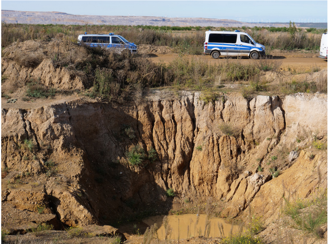
Police vans in between the edge of Hambach Forest and the open pit of Tagebau Hambach, Buir, Germany, 7 October 2018.