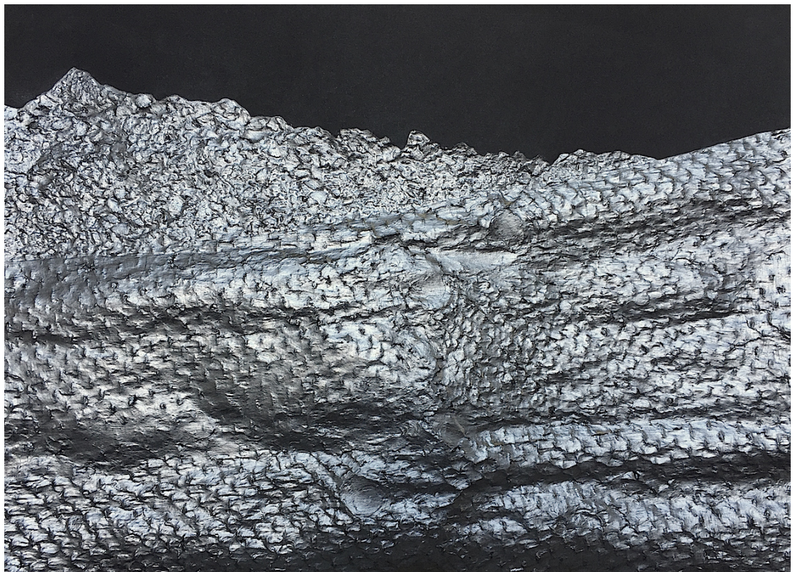
Landfillscape , 2018, graphite on paper, 35 x 50 cm.