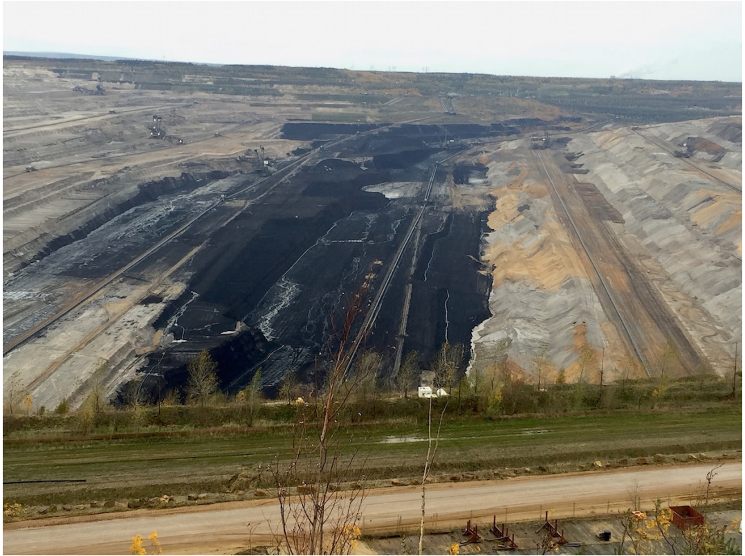
Tagebau Hambach, Germany.