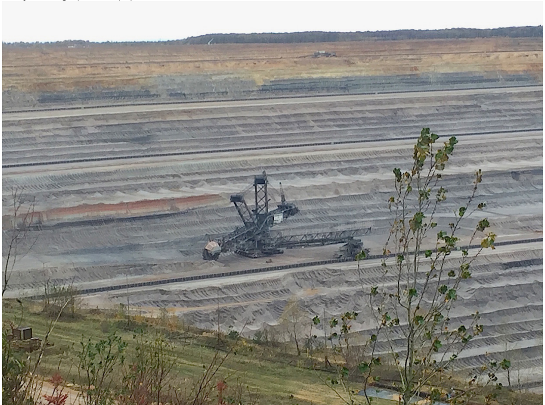
Etzweiler, Elsdorf, Germany.