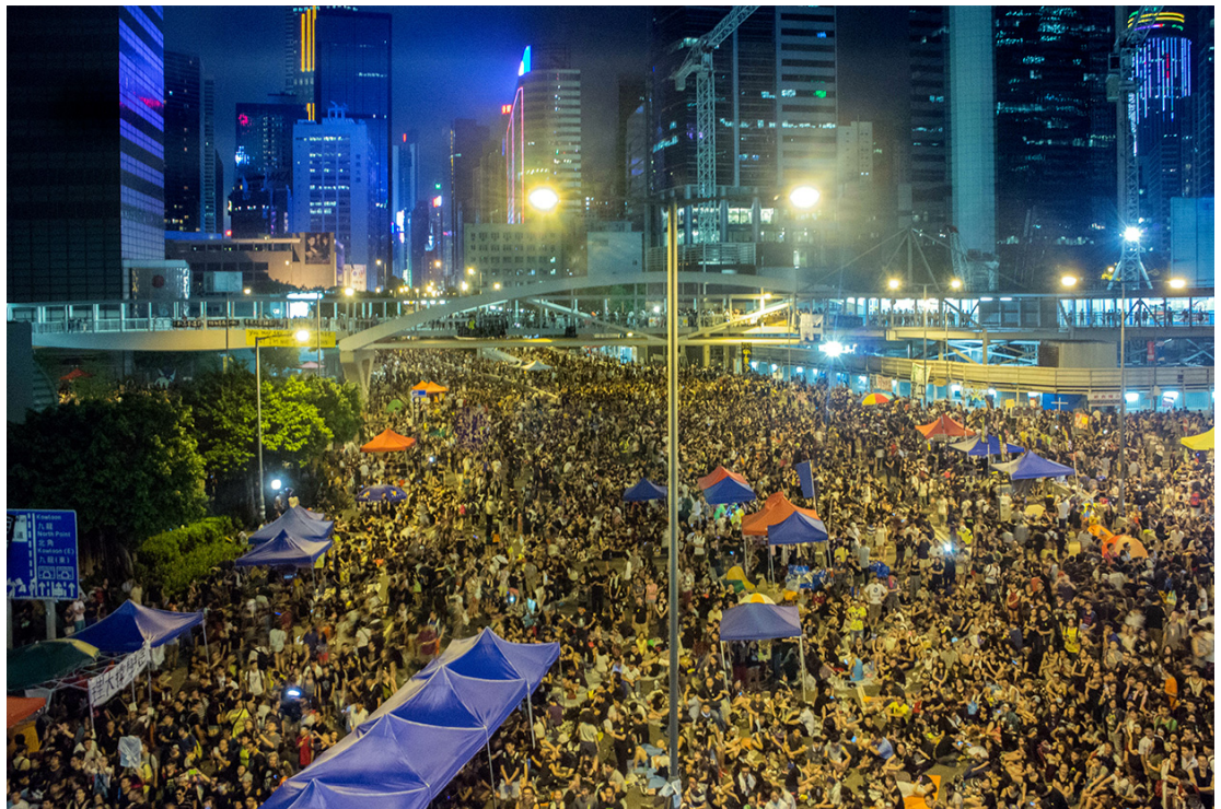
Hong Kong Occupy Central in Harcourt Eoad, 2014.

The so-called 'movement(s) of the squares' 1 did not precisely invent a new dynamic of mobilization of crowds and activation of public space – it rather revealed an emerging spatial order enabled by distributed electronic communication networks and the proliferation of wireless, mobile media in extremely 'densified' urban spaces. This emerging spatial order produced paradoxical spectacles that seemed at once strangely familiar and curiously novel, massive as well as evanescent.