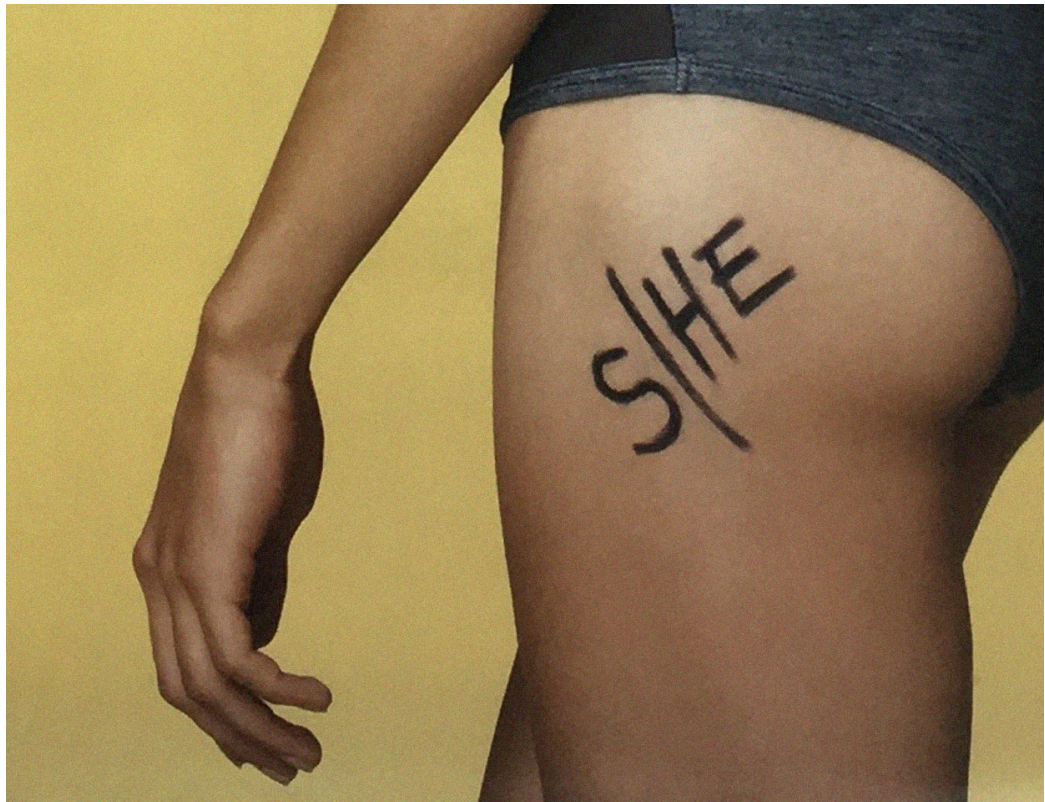
‘S/HE’ scribble found on an ad in Brussels.