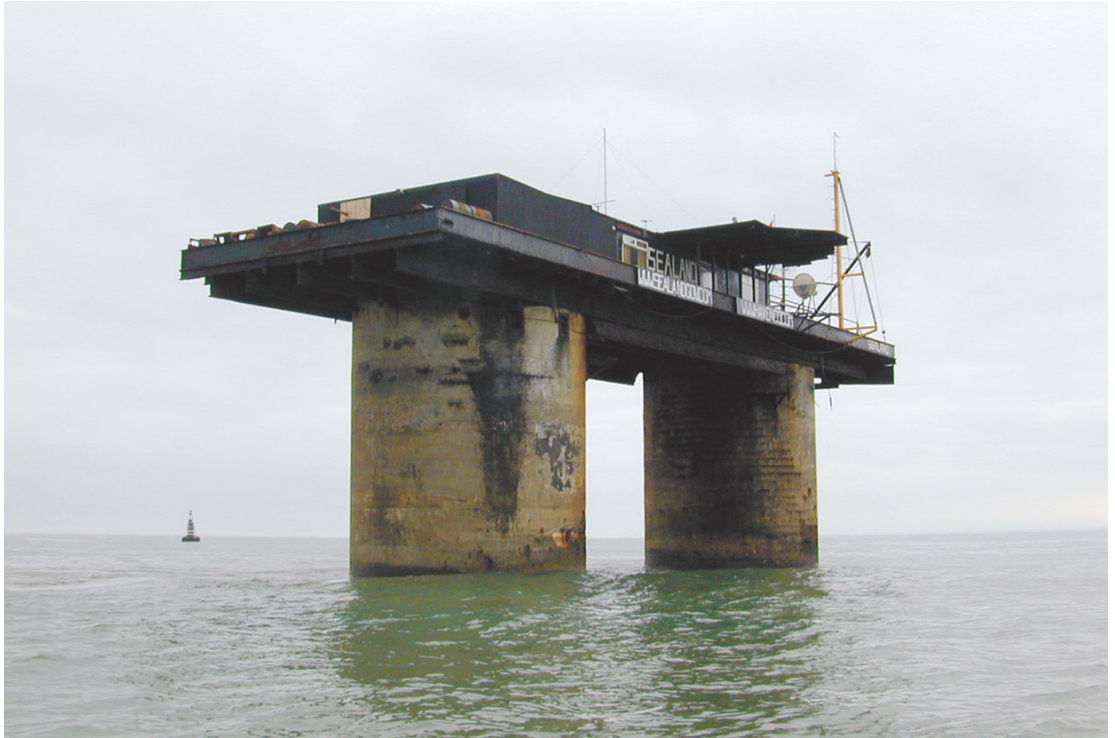
The former war platform off the coast of England in the North Sea – known since 1967 as the Principality of Sealand.