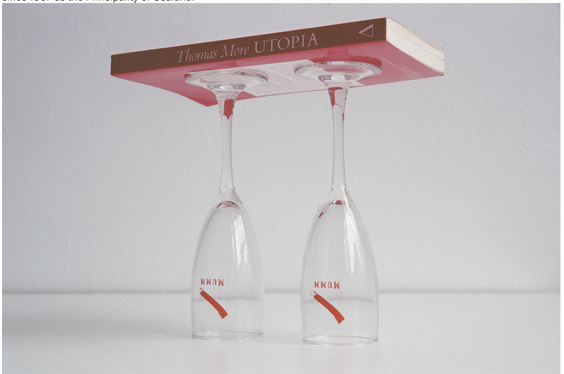
Sealand – Stealth Country (Utopia).