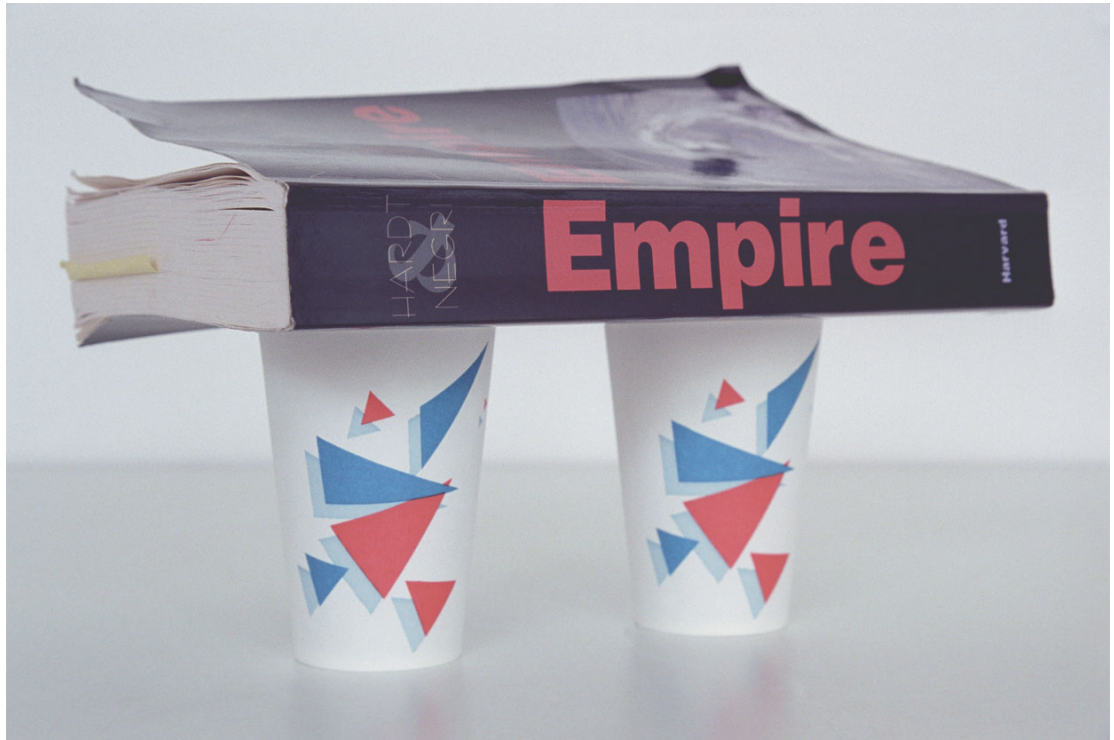
Sealand – Stealth Country (Empire).