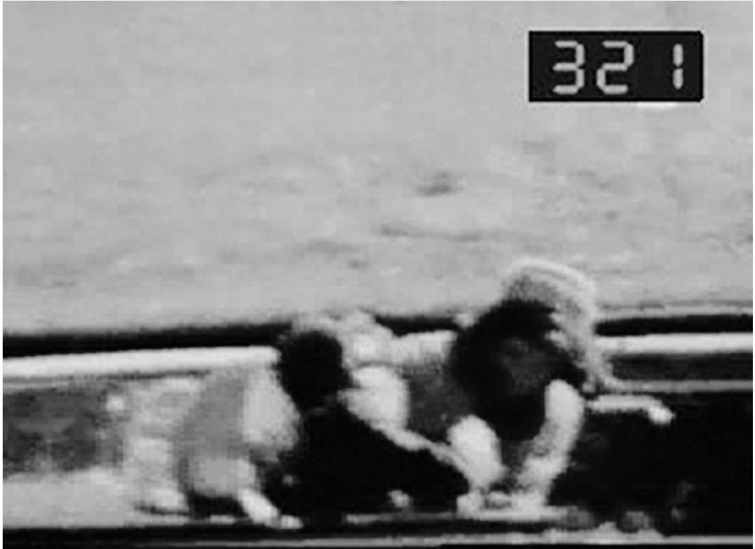
Fragment from the Zapruder film of the murder of J.F. Kennedy, Dallas, 1963.