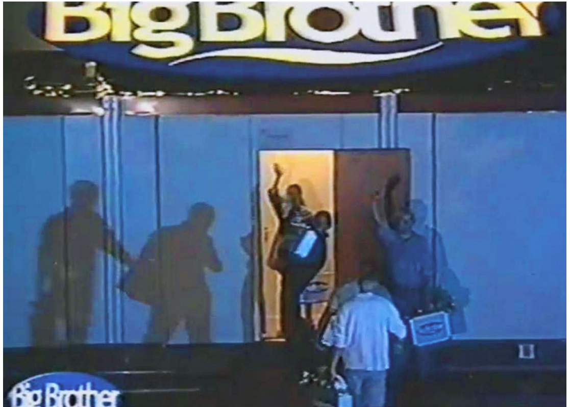
Entrance of building.