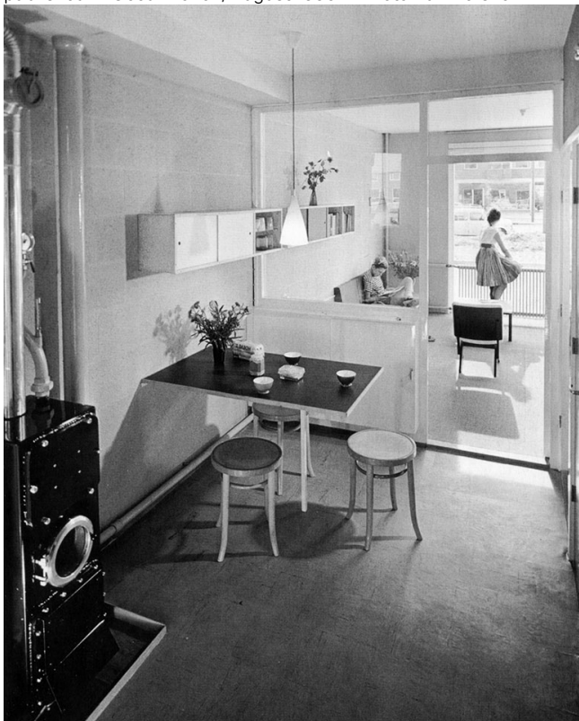
The rooms in the model home flow into one another without thresholds between them. When doors are necessary, they are designed to be as transparent as possible.