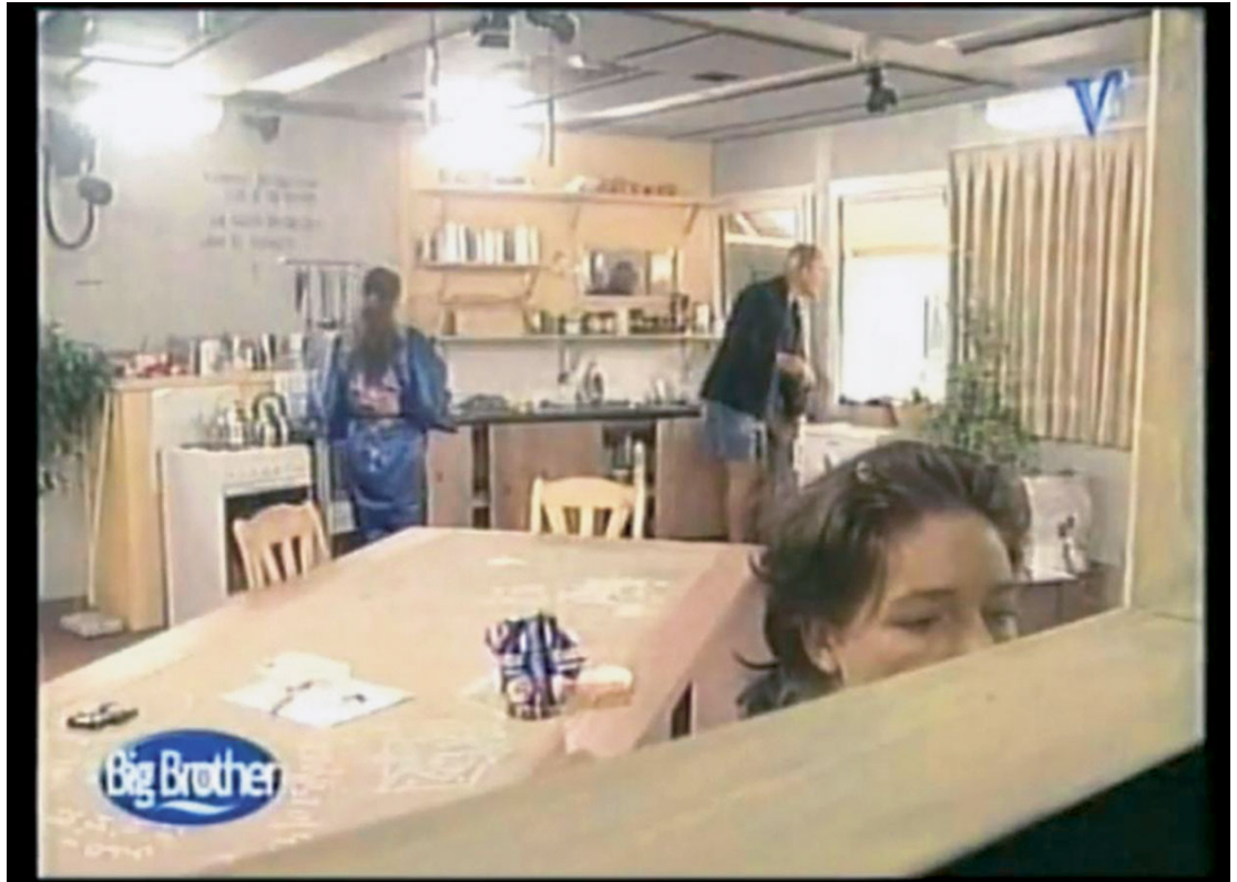
Big Brother house, from the Big Brother series produced by Endemol, broadcast on Veronica from 16 September to 30 December 1999. View of interior through two-way mirror.

As is known, Big Brother is named after the tyrannizing System in George Orwell's 1984 – another dystopia in which openness and transparency are described as methods of suppression. Orwell's Big Brother uses surveillance as a means of colonizing the individual's private space and enforcing disciplined behaviour. By contrast, what is stimulated by means of surveillance in the Big Brother programme is abnormal behaviour. The presence of cameras – and thus viewers – titillates the participants' egos. In the vacuumed interior of the house, their prickled egos run into one another every other minute, resulting in explosions of Big Feelings (love, hate). Their exhibitionism is fed by our voyeurism. Why do we want to peek through the one-way mirror?