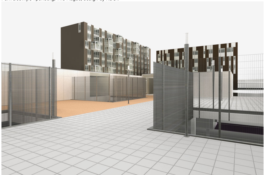
Diederien Dirrix van Wylick Architecten, Baekelandplein, Eindhoven (project