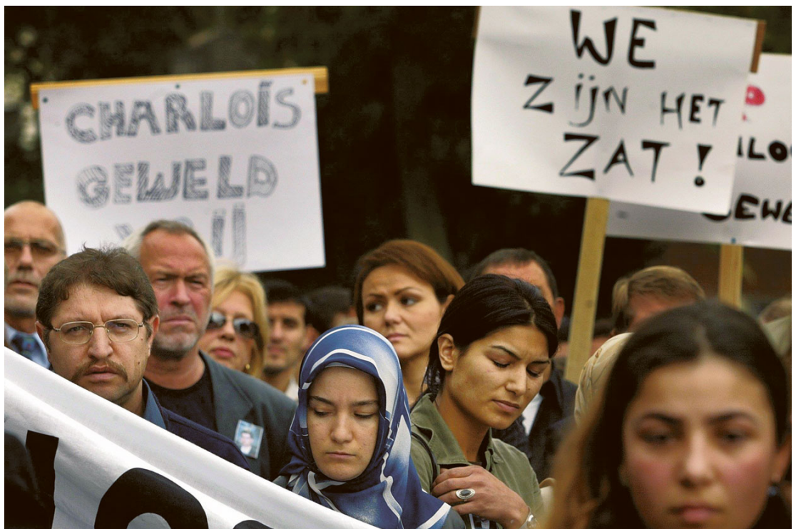
Silent march in Charlois, Rotterdam.

As city authorities are confining themselves to their basic tasks and citizens are compelled to take the care of their living environment into their own hands, 'gated communities' like those becoming increasingly common in the United States may not be far off for the Netherlands, according to Harm Tilman. The development of a society of control in which the issue of security is high on the political agenda has opened the way for this in the Netherlands.