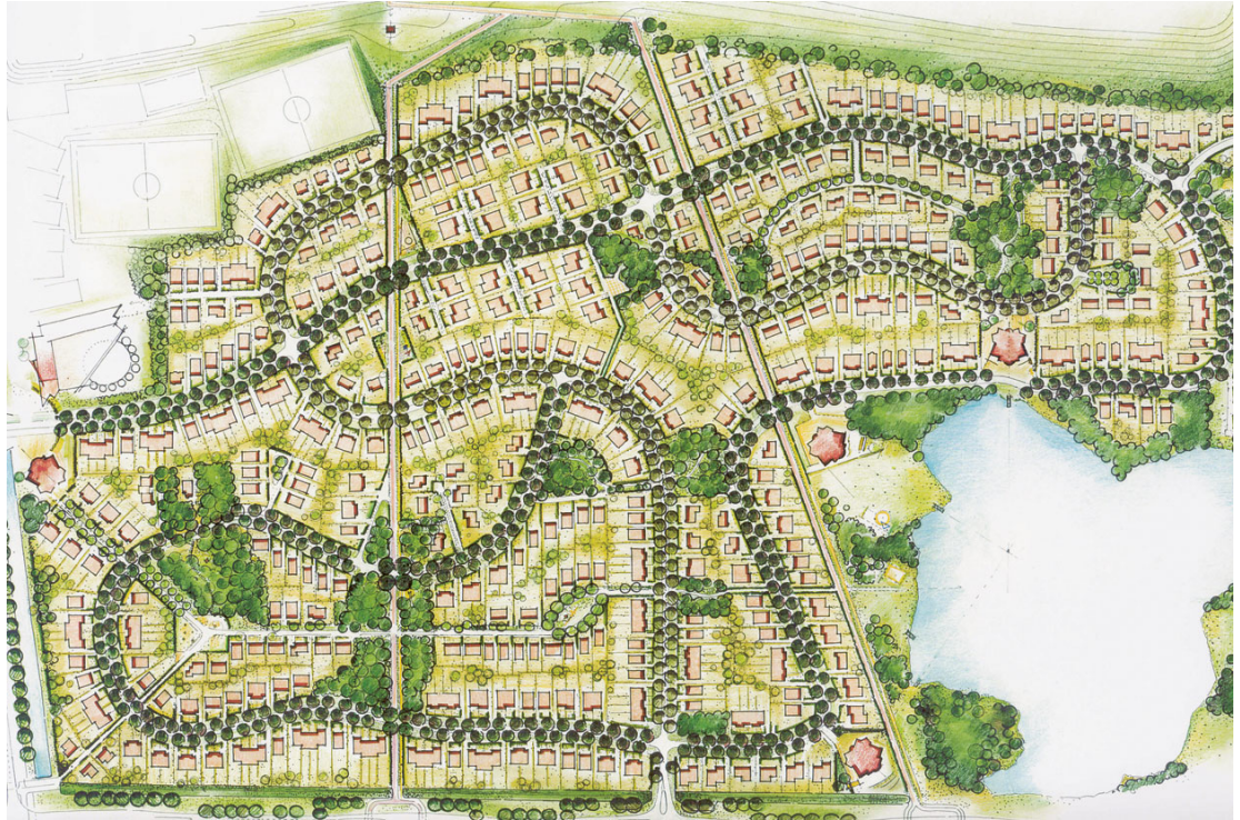
Park Boswijk, Ypenburg, The Hague, design by RBOI.

This places repairs to the most intimate of spaces high on the agenda. This is coupled, as made clear by Sloterdijk, with an expansion of the private sphere. This is also happening in the Netherlands. Does this mean that the Netherlands, like the United States, will see 'defended neighbourhoods' and 'gated affluent communities'? The question is not whether, but rather how this phenomenon will manifest itself in the Netherlands. The Dutch housing market has changed from a supply into a demand market, and security is an important 'positional good' in this market. This will also find expression in design.