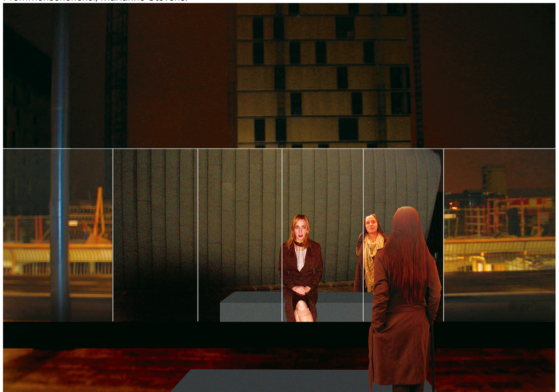
Design for Optionaltime 3.