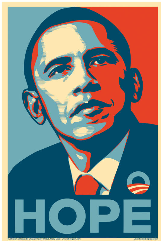
Obama / Hope, poster by Shepard Fairey, 2008.

The disjuncture between the dreams conjured up by Obama and the disappointing political realities he’s delivered has had disparate effect across the political spectrum. Liberals, for the most part, have given up their dreams. They support the president, not with the initial emotion that Obama had once masterfully siphoned, but instead with a dispirited sense of necessity. The popular right, on the other hand, has found something to dream about again. No place is this phantasmagoric renaissance on display more than with the Tea Party.