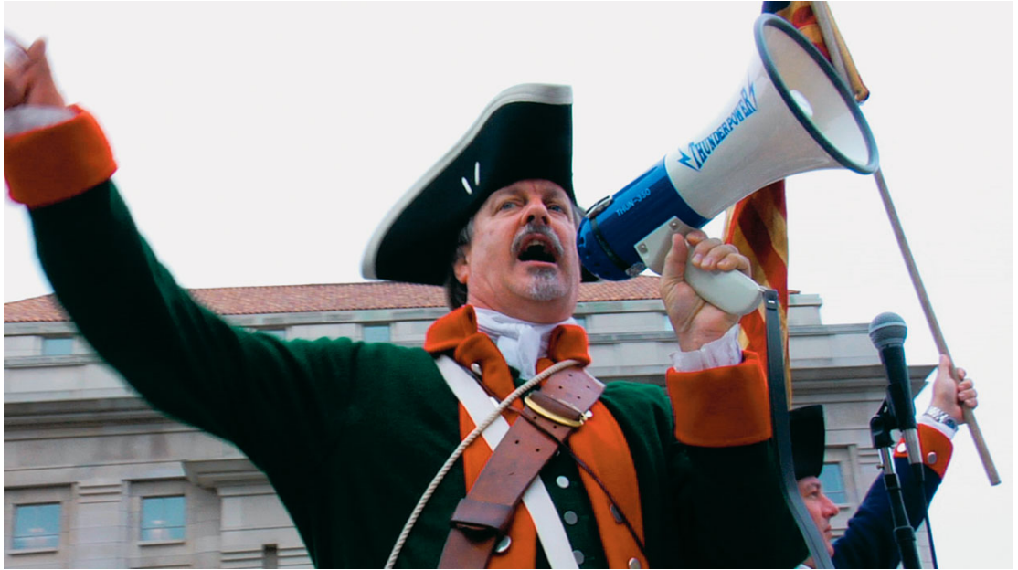
Tea Party protest, ca. 2010.