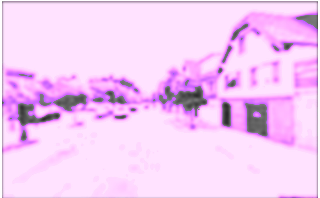
Constant Dullaart, Detour World , screenshot.

Please check out this link for Constant Dullaart's Detour World .