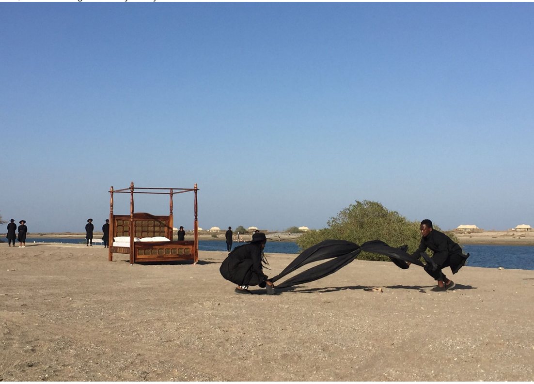
Mohau Modisakeng, Land of Zanj performance, March 8, 2019, Kalba Ice Factory.

You mentioned that translation may not necessarily occur in spite of the mediation of a curator for reasons such as different constitutions of public space and civil society.<sup>2</sup> One of the refusals that I am interested in is the simultaneity of flows against the monologic force of narration. For example, how nation-states are produced by the homogenizing structures of community and narration. Recently, I have been drawn to a local reference orosipon, an old word for story in the Bikol region, south of the Philippines. Its root word osip is not equivalent of 'tell', but rather approximates the act of telling in an open and ongoing manner by multiple speakers to no one in particular. The hearer can be the next