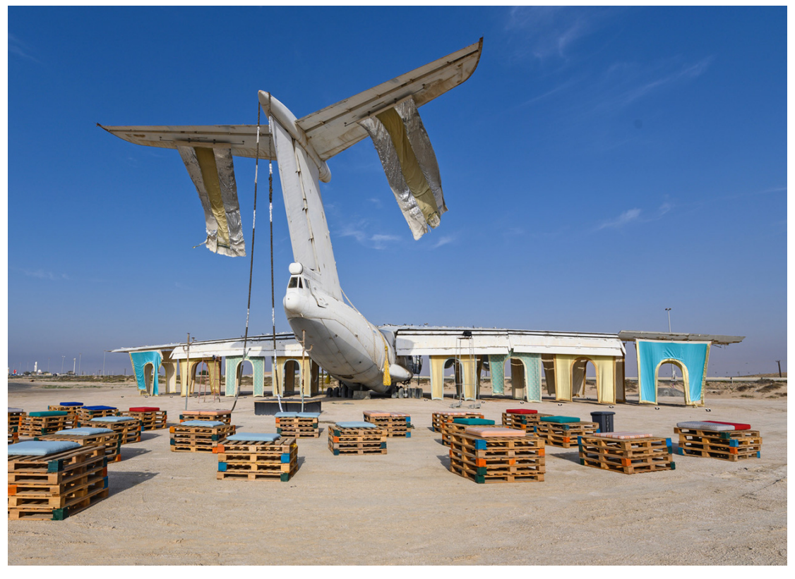
New Orleans Airlift, The Trans-National , 2019, abandoned airplane site, Umm Al Quwain.

The remainder of the Emirates' cool breeze welcomed curator and scholar Claire Tancons' Look for Me All Around You , one of the three independently curated platforms of <u>Sharjah Biennial 14</u>, in early March last year. Identified by the biennial-going international art crowd to possess 'a strong performative bent' <sup>1</sup>, the reading consistently aligns with Tancons' methodology in relocating the act of looking 'towards the aural' and in reiterating the space of feeling in the vibrations of the echo within the infrastructures of global exhibition-making.