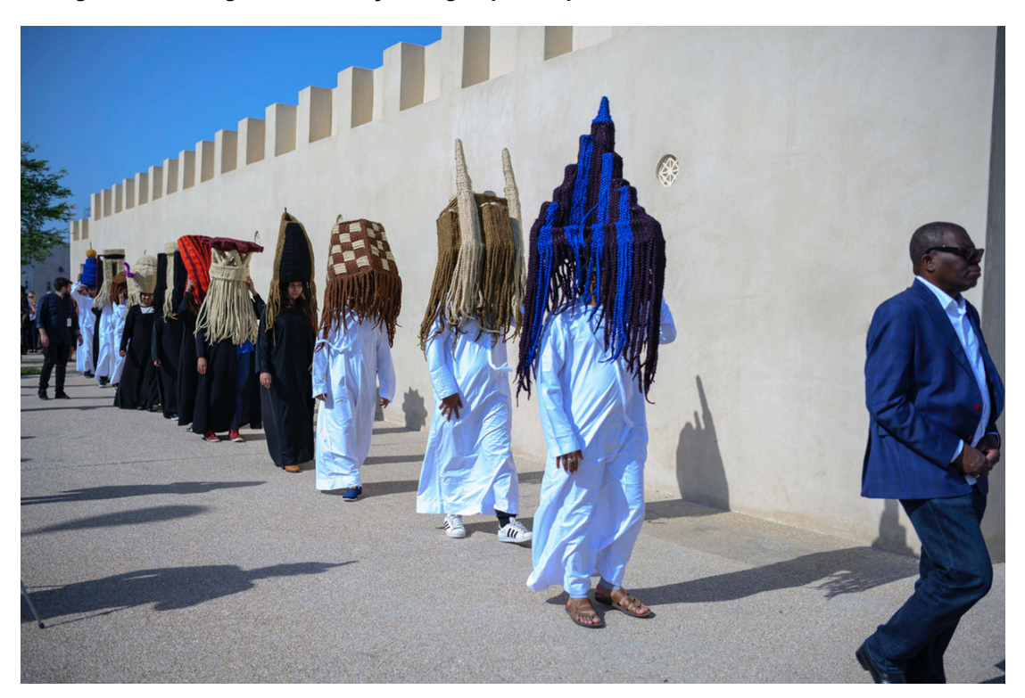
Meschac Gaba, Perruques Architecture Émirats Arabes Unis , performance, film still, 9 March 2019.

paraosipon (storytellers) or para-osip (tellers of tale). The simultaneity and equality of translation and interruption in orosipon as a radically and morphologically incomplete dialoguing refuses a complete narration. It also refuses the task of 'tell me' only to tell a different story or different stories. I am not sure how to accommodate this question in this limited opportunity, but I am compelled to ask how you to contour (test or exhaust) dialogues, monologues and storytelling in public performances.