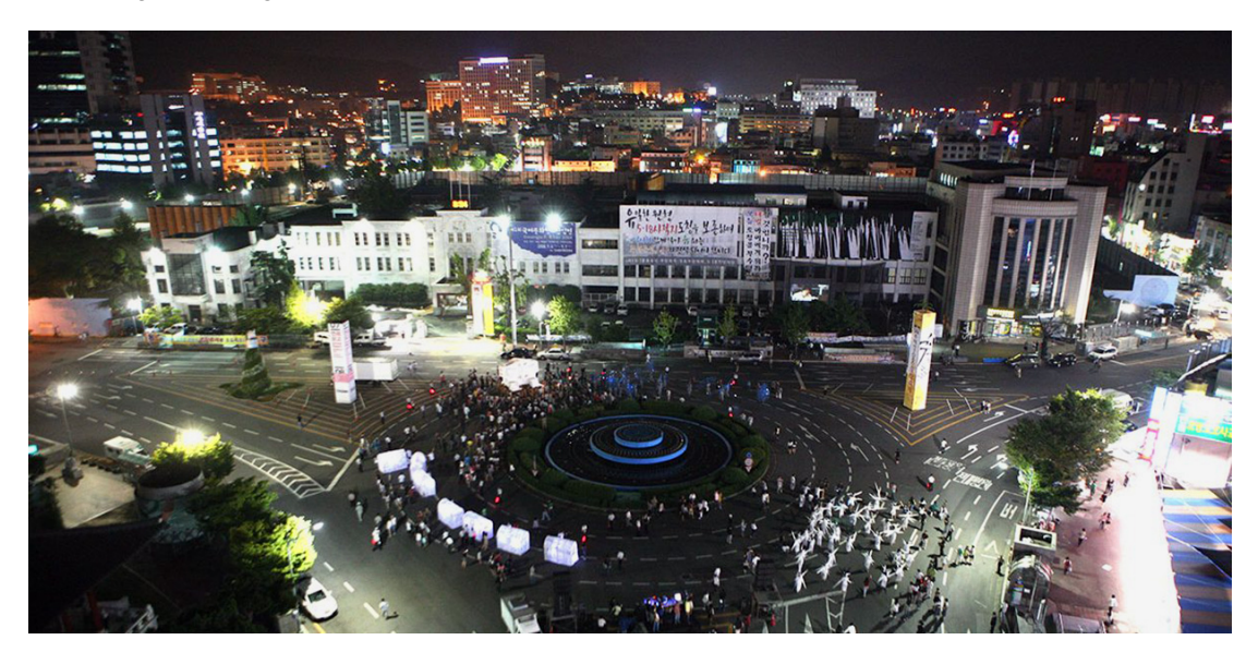
Spring, aerial view of the May 18 Democratic Square, 2008.

future, an unprecedented majority of voices should form images and imagine forms of governance. Should that fail, the rhetoric – let alone the practice of art- and exhibition-making even under the state of exception created by the biennial context – is under suspicion of a collusion with power. In closing, in response to your question, voices were masked and images hushed through the various processes of distanciation or flight, encoding or hiding.