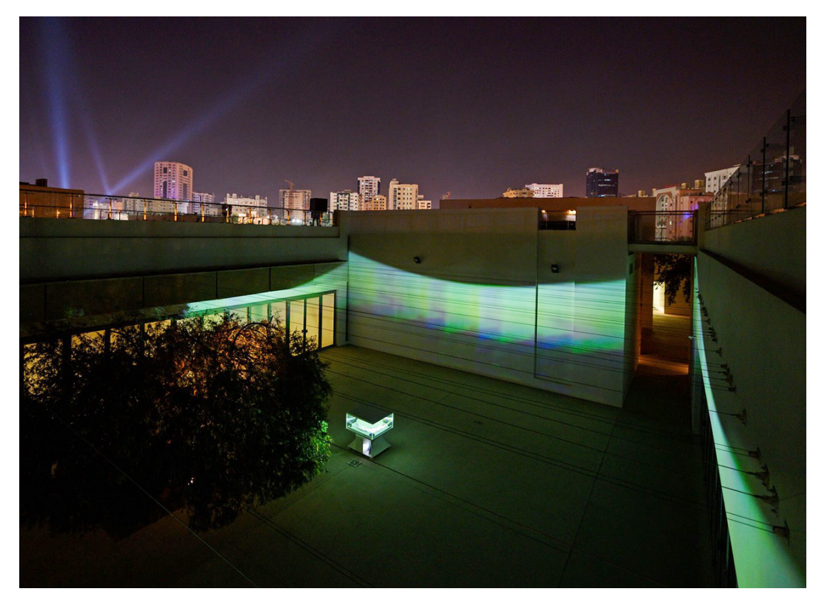
Caline Aoun, Time Travel, 2019.

Your scholarship draws from art historical and cultural studies of performance, performing arts, and citizen movement and organization. All of these have been shaped and inflected by dominant Euro-American discourses and postcolonial and decolonial thinking and action. The hegemon remains as the most concrete fold and vector to engage with. Could you speak more about the emphasis on the 'after -' (after-images, after-forms) and other prefixes such as 'de -' and 're-' (dispossessive and repossessive disposition) as your ethico-political position, which seems to be a lateral move from the familiar tools of deconstruction, such as the project of 'counter-' (counter-images, counter-narratives, counter-mapping)? Perhaps you could also elaborate on how this interplay of directions emerge in the works of artists in the biennial?