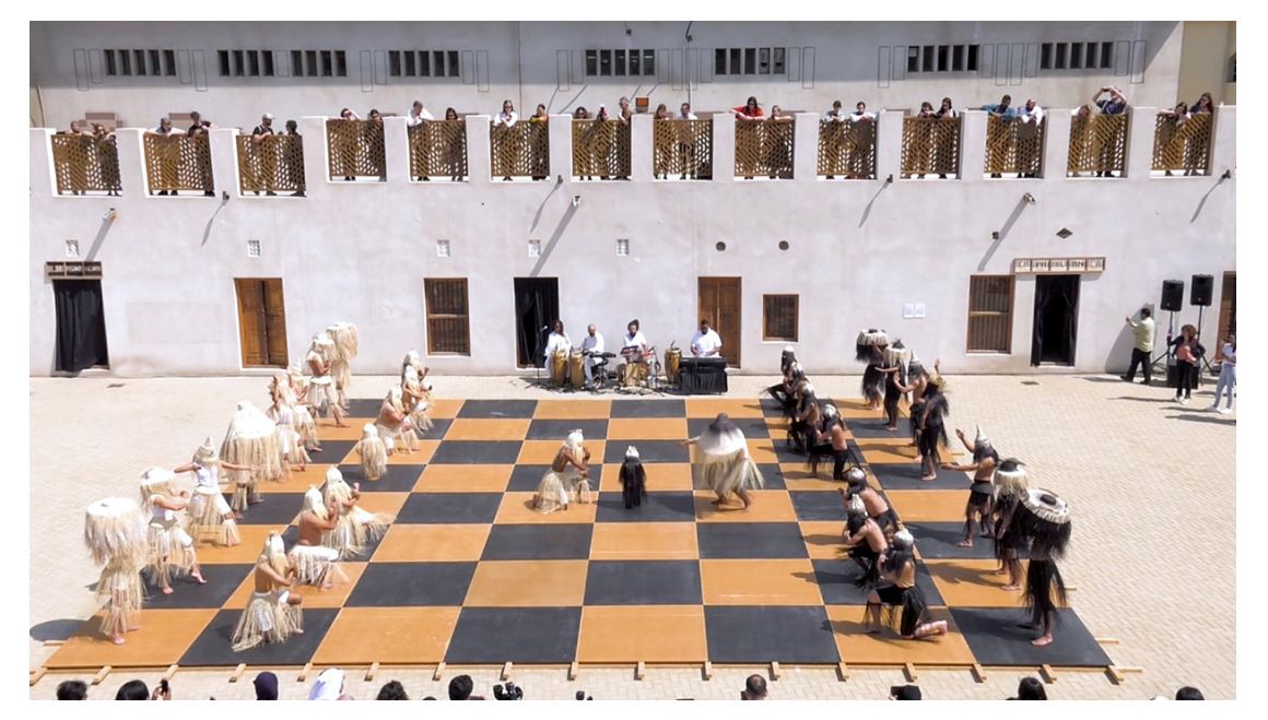
Ulrik López, Pataki 1921 , performance, film still, 9 March 2019.

In this interview, conducted between January and December 2019, the task of understanding Tancons' practice and Sharjah Biennial platform is a deliberate measure of coinciding her inquiries and proposals with other narratives of redemption and resistance, i.e., all the way south to insular South East Asia. This chance is a collaborative opportunity of deepening counter-histories, pronouncing the utopic aspiration for supremacy yet knowingly keen on its status as a virtually unstable fellowship of strategies and positions. The disaffection with the dominant nomenclature of 'minor histories' and the essentialist demand of narration reconfigure here as a re-potentialized albeit 'obscure' project of enlightenment from the low: a call for translation and interruption through multi-vocal agencies across many time-space continuums.