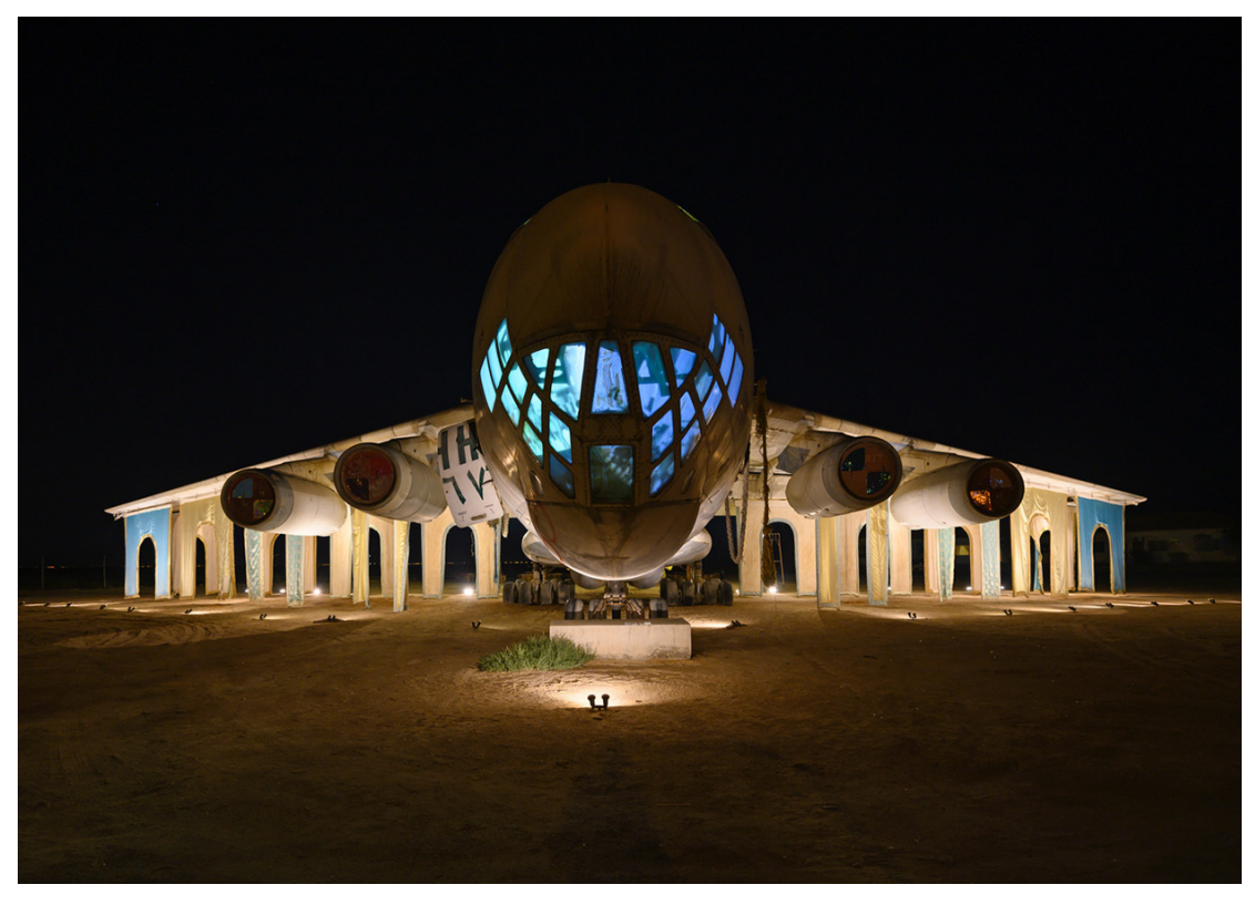
New Orleans Airlift, The Trans-National , 2019, abandoned airplane site, Umm Al Quwain.