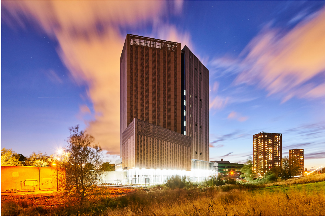
Data Tower, Amsterdam.