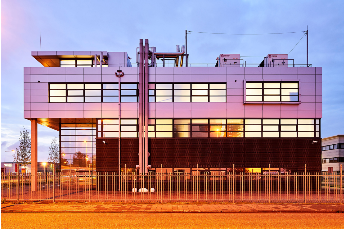
Equinix AM8 Datacenter, Amsterdam