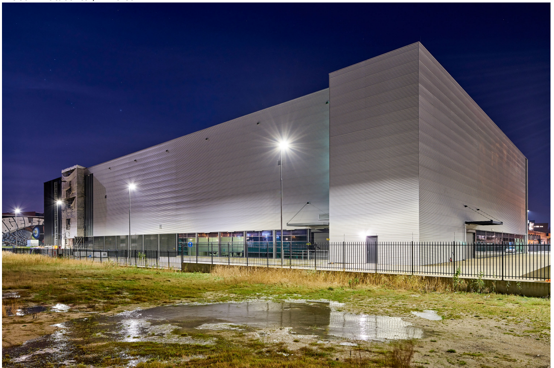
Equinix AM6 Datacenter, Amsterdam.