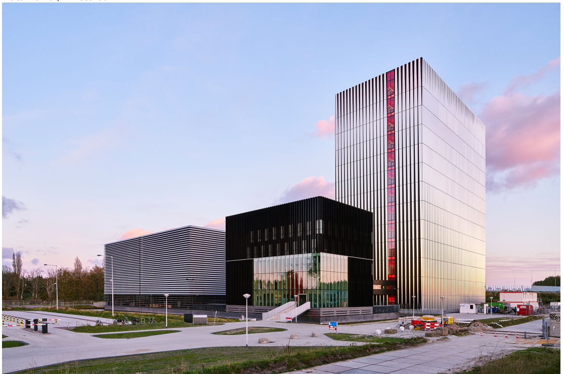
Equinix AM4 Datacenter, Amsterdam.