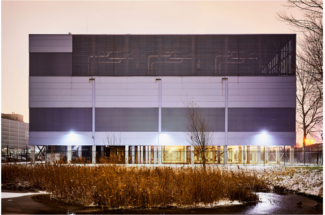
Equinix AM5 Datacenter, Amsterdam.