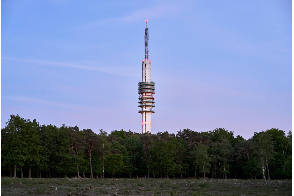
Alticom Datacenter, Hilversum.