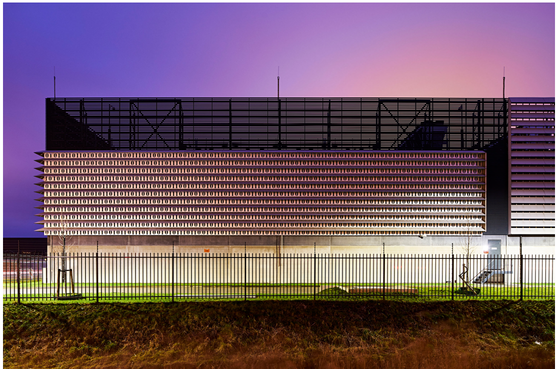
Interxion AM8 Datacenter, Rozenburg.