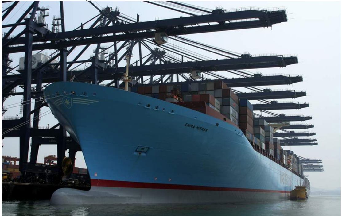
Eleven cranes simultaneously unload the largest container ship in the world, the Emma Maersk.

that cover the holds of other types of container ships.