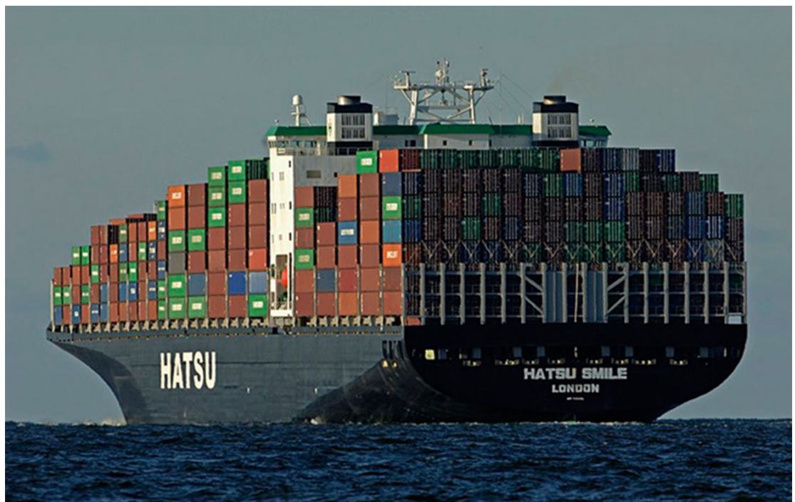
A relatively new type of vessel is the 'open top' or hatchless container ship. The advantage of the open top is that it speeds up loading and unloading times, since it is unnecessary to stop and remove the water-tight hatches

In comparison with the acceleration of progress, which continues to be the privileged domain of such electronic devices for instantaneous transfer as the mobile phone, transport systems have no more to offer than a gradual yet crucial expansion of transport capacity. Their focus is no longer on speed, but on the reduction of delays in the sites of transfer and transit, the 'multimodal platforms', where separate modes of transport like the car, the taxi, the (hired) bicycle, the bus, the tram, the metro, the train and even the airplane come together. The strategy is derived from the just-in-time distribution logistics of freight transport, the quantities of which have increased exponentially, to the detriment of storage in warehouses. This also explains the (network) position of all those sites along the coasts of continents where ground and air transport is being combined with maritime freight. The source of this transport revolution is undeniably at sea; it is a revolution in 'load capacity', symbolized by the container ship.