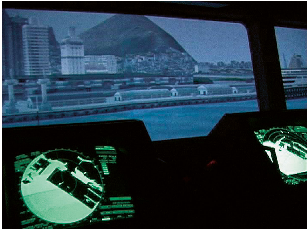
Stills from the video by Ursula Biemann, Contained Mobility , 2004.

Cultural critic Brian Holmes analyses the genesis of the distributional machinery of intermodal transport that circulates commodities through the global economy. What are the implications for our way of life, both for people tied to a particular area and for migrants? Is it possible to escape capitalism's laws of motion?