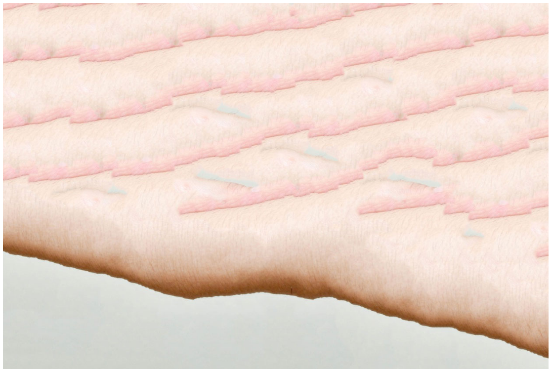
All images by Federico Antonini

The Cloud, and those who live in it like 0001, can introduce us to algorithms that allow us to exist as a whole. This algorithmic process of becoming sees the whole as not merely the end but the means to it. In the Cloud, it is possible that we are always already whole, and that there we find our desires are not ours alone. ‘Cloud_0001’ is part of the Open! COOP Academy series Between and Beyond [ www.onlineopen.org/between-and-beyond ].