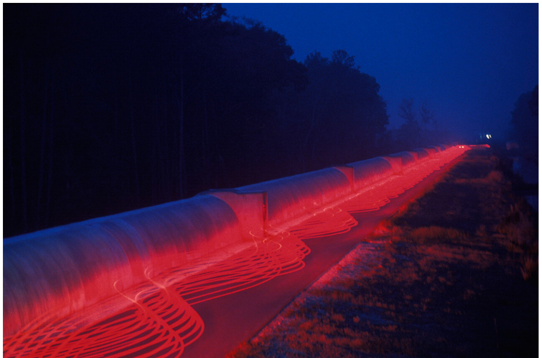
A time-exposure representation of the Laser Interferometer Gravitational-Wave Observatory (LIGO), in Livingston, Louisiana