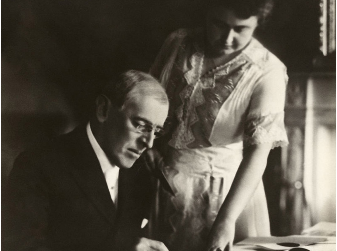
Woodrow Wilson and his wife in 1920 after Wilson suffered a stroke during a convention in 1919 which resulted in his anosognosia.

The twentieth century is characterized by a tendency to deal with diseases like anosognosia as crazy cerebral manifestations and, in most of the cases, diagnosed and treated in social terms through, at best, folk psychology. 20 The content of the PSM creates a sense of coherency. What has been considered crazy behaviour from a third-person perspective during the last century 'might be the best viable path through problem space and the most economical manner of achieving functional constraint satisfaction.' 21