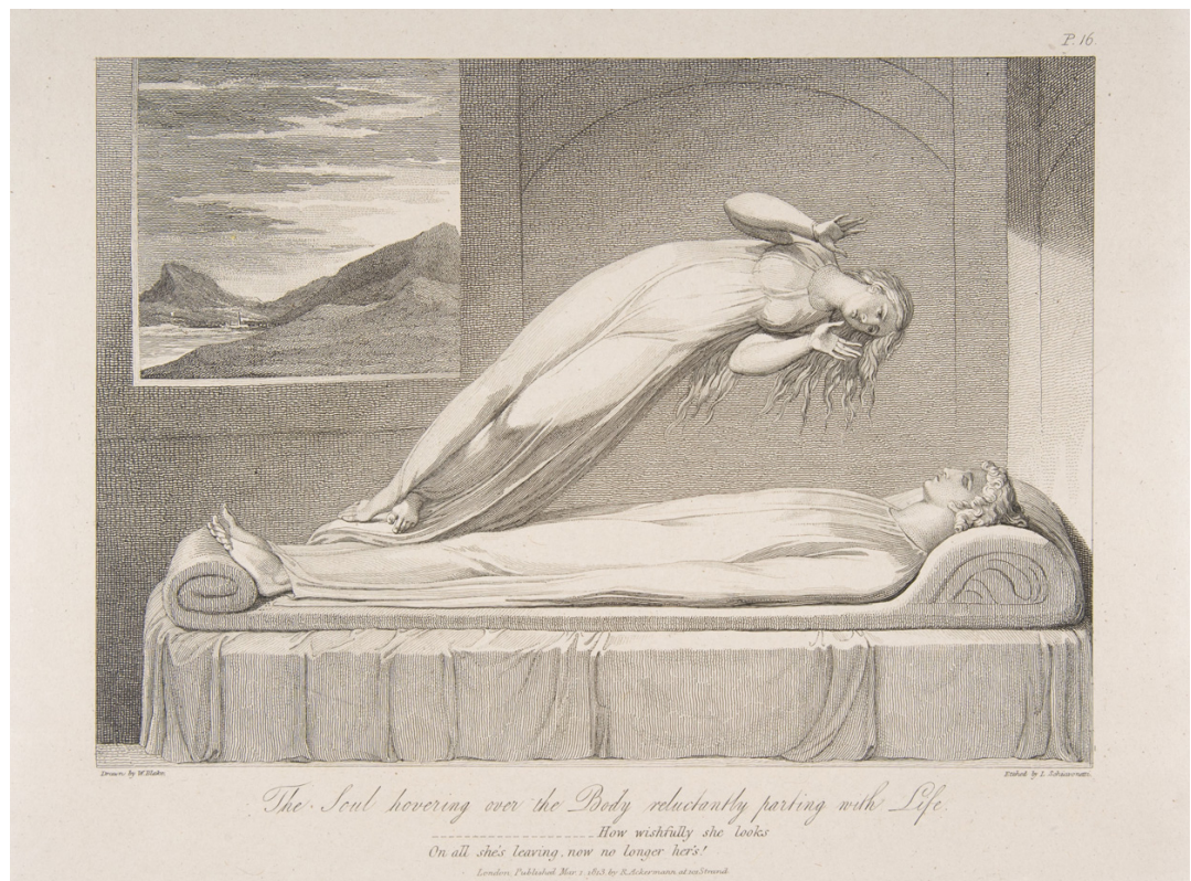
'The Soul Hovering over the Body, Reluctantly Parting with Life, from The Grave ,' a poem by Robert Blair, Luigi Schiavonetti, after William Blake, 1813,

This image of what has been considered the soul in various cultural and theological approaches might correspond to the three key features of an OBE: 1) representation of one's own body; 2) the body seen from a third-person perspective; and 3) a second representation of one's own body outside of our central spatial reality.