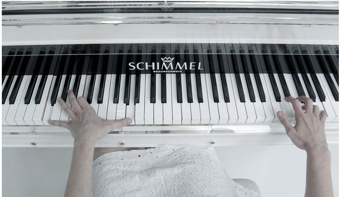
Miguel Angel Rego Robles Post-Contingent Coherence , 2016, video still