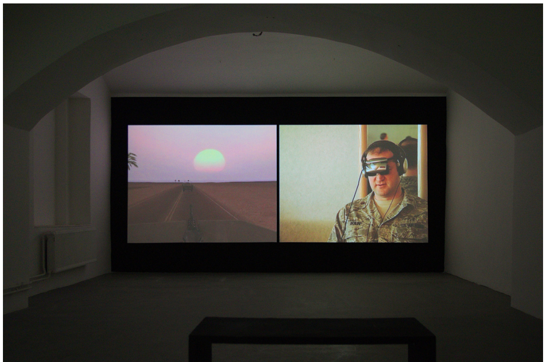
Image 1. Harun Farocki, Serious Games III: Immersion , 2009, 2-channel video, 20 min., installation view