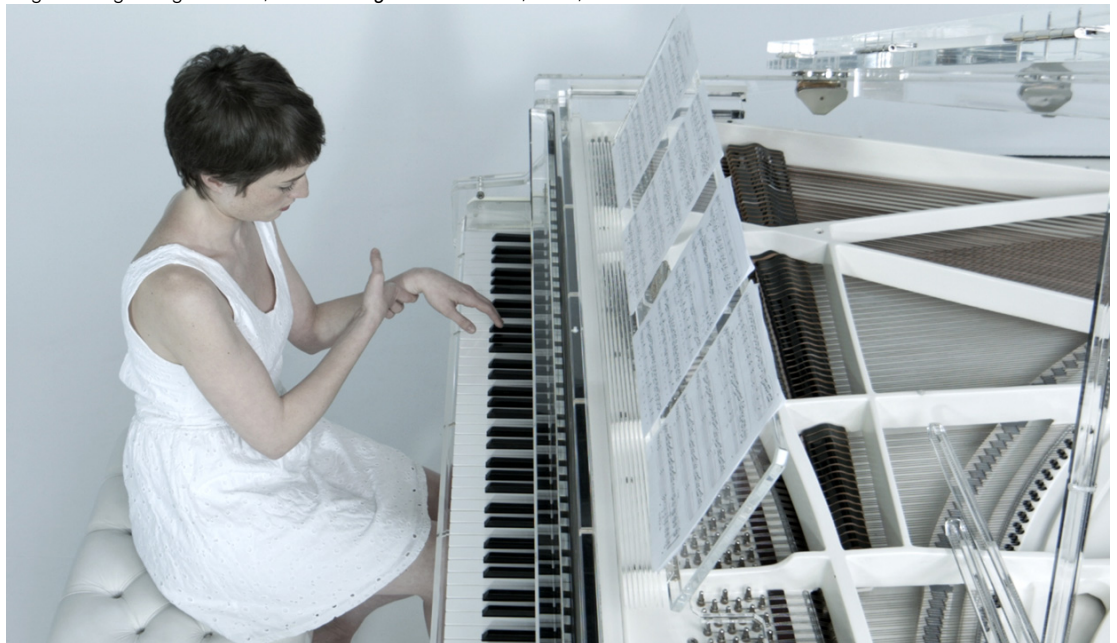
Miguel Angel Rego Robles Post-Contingent Coherence , 2016, video still

My project Post-Contingent Coherence (2016) discusses this disease to emphasize the process of global coherency that the conscious self-model provokes. Post-Contingent Coherence shows a pianist performing Nocturne Op. 55, No. 1 in F Minor by Frédéric Chopin. The pianist suffers from anosognosia, and the viewer's perception changes according to the perspective of the camera, and also to what the audience hears from the instrument – an overlap of different melodic realities. The first-person perspective reports specific content of the PSM, mostly transparent, 23 but at the same time offers a glimpse of the opacity in terms of the hidden mechanisms involved in the process of self-coherency in these kinds of situations. In this artwork the first- and third- person perspectives are underscored to explore the self-model in regards to confabulations derived from the lack of feedback from the paralyzed left side of the body. In Post-Contingent Coherence , through images and sound, we can see different self-models interacting as distinct realities happen at once. 'Some of the elements of the model may become opaque to a degree, by incorporating representations of their own functional structure, and thereby the possibility of its malfunction.' 24