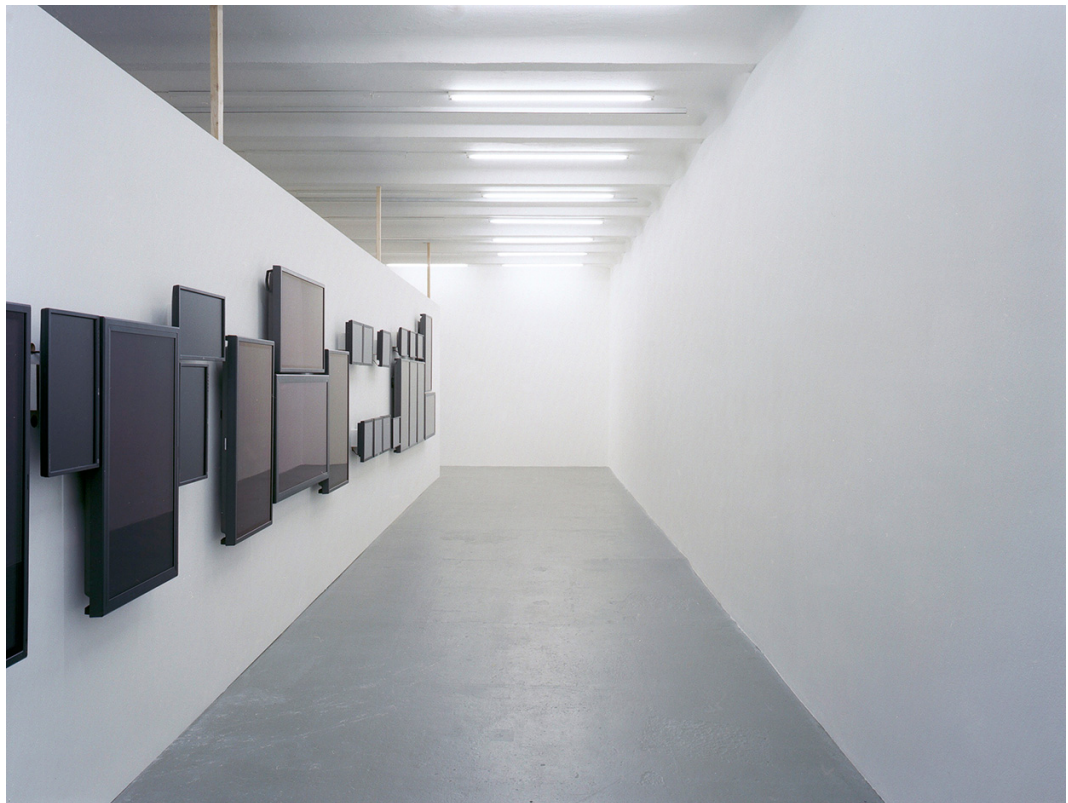
Geissler / Sann, Volatile Smile , mixed media, dimensions variable, installation view at Neue Gesellschaft für bildende Kunst, Berlin, 2011, courtesy Geissler / Sann.

Since the 2008 economic crisis, we have witnessed the emergence of an entire discourse in art practice centred around representations of the financialization of economy. One basic assumption underpinning most of this artistic and textual production is that successful representations of finance today are wholly impossible: work in this discourse recognizes, for instance, that the sheer speed of financial transactions renders them beyond (or below) the threshold of human perception, making them literally extra-aesthetic,