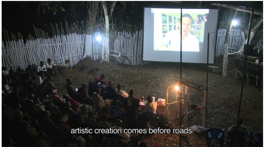
Richard Florida addresses a crowd via Skype at the Institute for Human Activities's opening seminar in June 2012.

In passing, it is worth pointing out here that the idea of artistic labour (or 'creative' labour more generally) as directly productive of value – and therefore worthy of exploitation – is not exceptional at all any longer, but has become rather commonplace. More specifically, I am referring to the widespread enthusiasm concerning the so-called 'creative economy' here, an enthusiasm best exemplified by Richard Florida's book The Rise of the Creative Class (2002) and its follow-ups. As Bernard Stiegler points out, the notion of the creative economy rests above all on the idea (which in itself can hardly be called innovative) that value and wealth are generated from ideas more than anything else. 20 In this discourse, however, 'creativity' generally tends to be considered an incredibly open signifier. Martha Rosler, for instance, has pointed out that what Florida has labelled the 'creative class' makes up about thirty percent of the workforce in the US – which gives the Floridas of this world plenty of opportunities to cook their books. 21 While it would be interesting to examine in more detail how the idea of the creative economy relates to art's alchemical creation of value, I will now keep my focus on the art world, which is only one segment of what Florida, in all apparent earnestness, calls the 'super creative core' of the creative class.