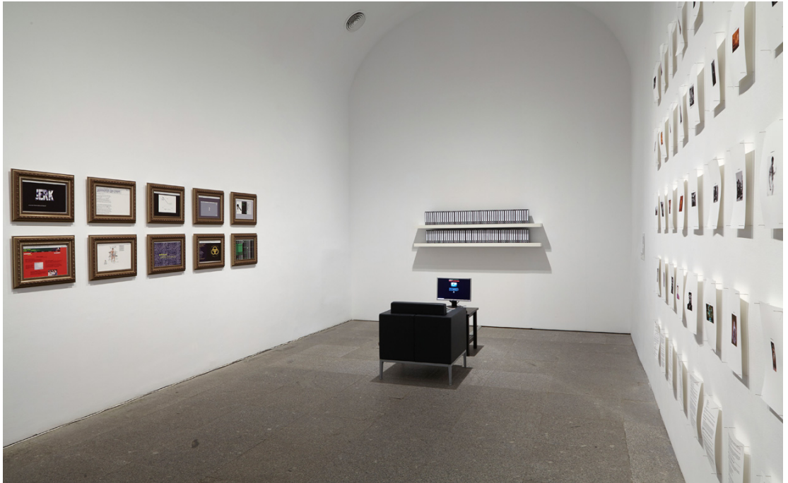
Las colecciones. (Museo Nacional Centro de Arte Reina Sofía, 2015)