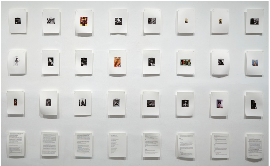
Technologies to the People.