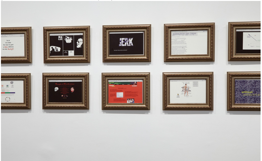
Technologies to the People.