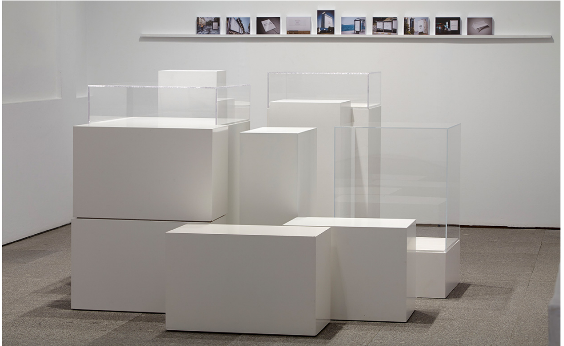
Not Found, 1000 casos de estudio.