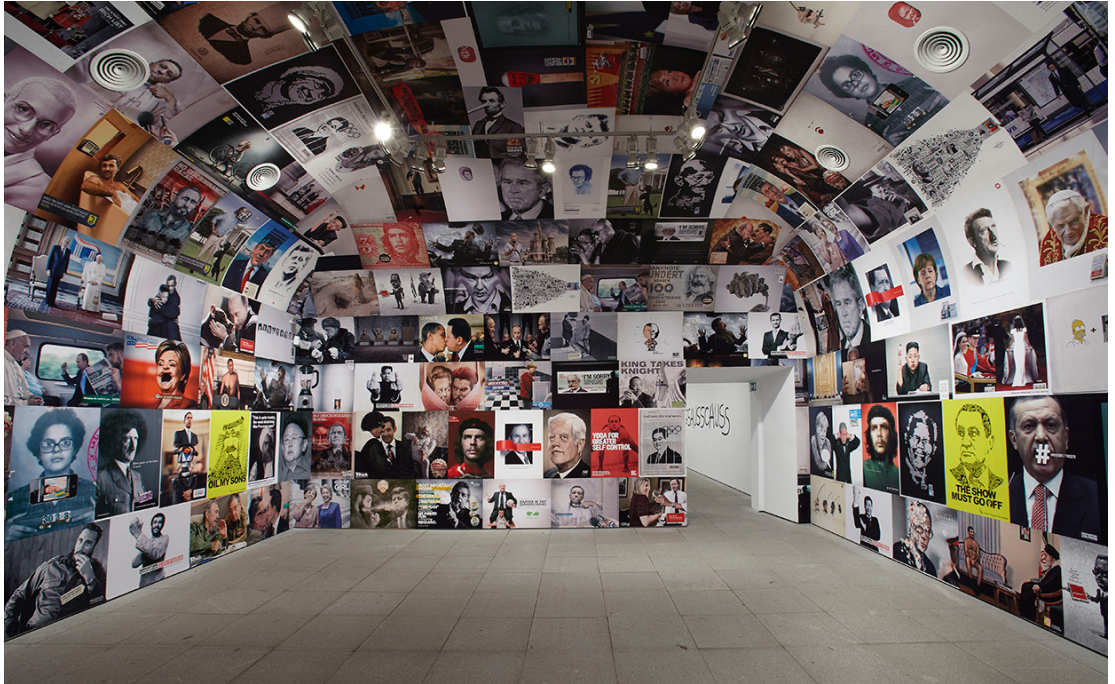
Dirigentes.