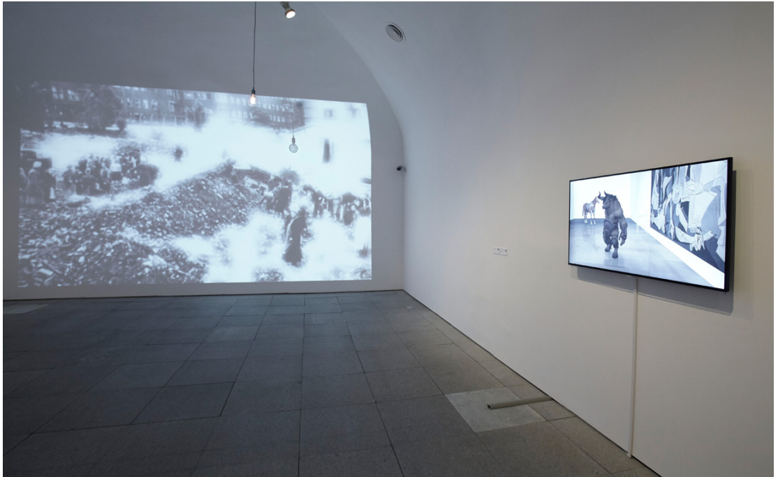
Pablo Picasso y Guernica.