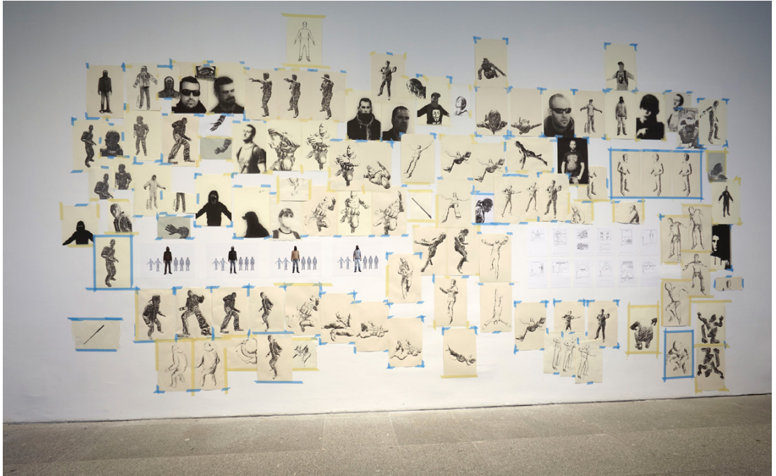
Infiltrados.