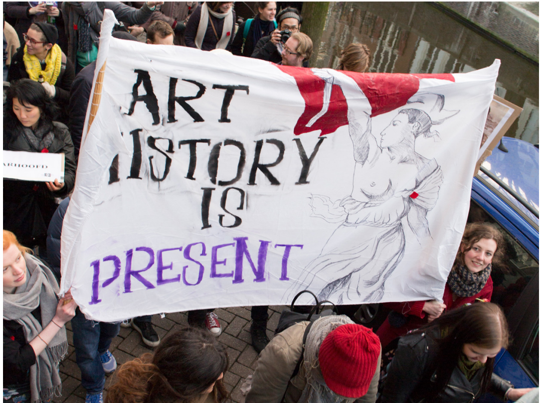
Art History is Present (2015), Art History Department, New University.