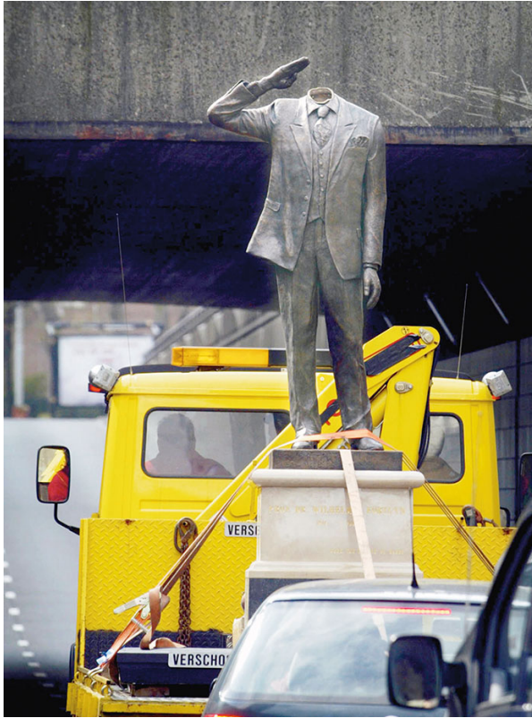
The statue of Pim Fortuyn was decapitated by a viaduct on the way to its destination.