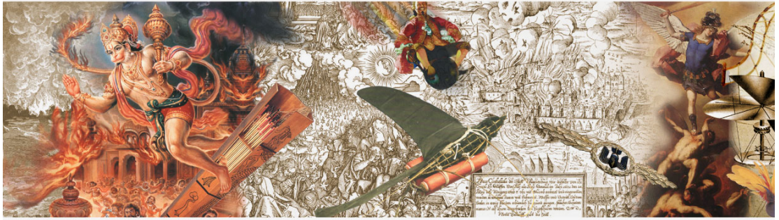
'Will Thou sweep away the righteous with the wicked?' asks Abraham - only Lot and his daughters escape God's judgement of fire and brimstone that devastates Sodom - the monkey Hanuman similarly destroys the corrupt city of King Ravana on Lanka with his flaming tal of fire.