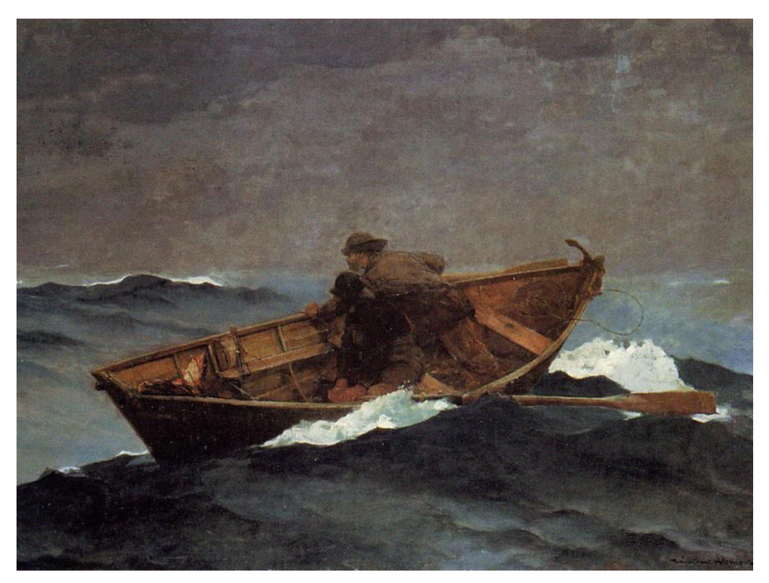
The letter concerns Gates's puchase of the painting Lost on the Grand Banks by Winslow Homer.