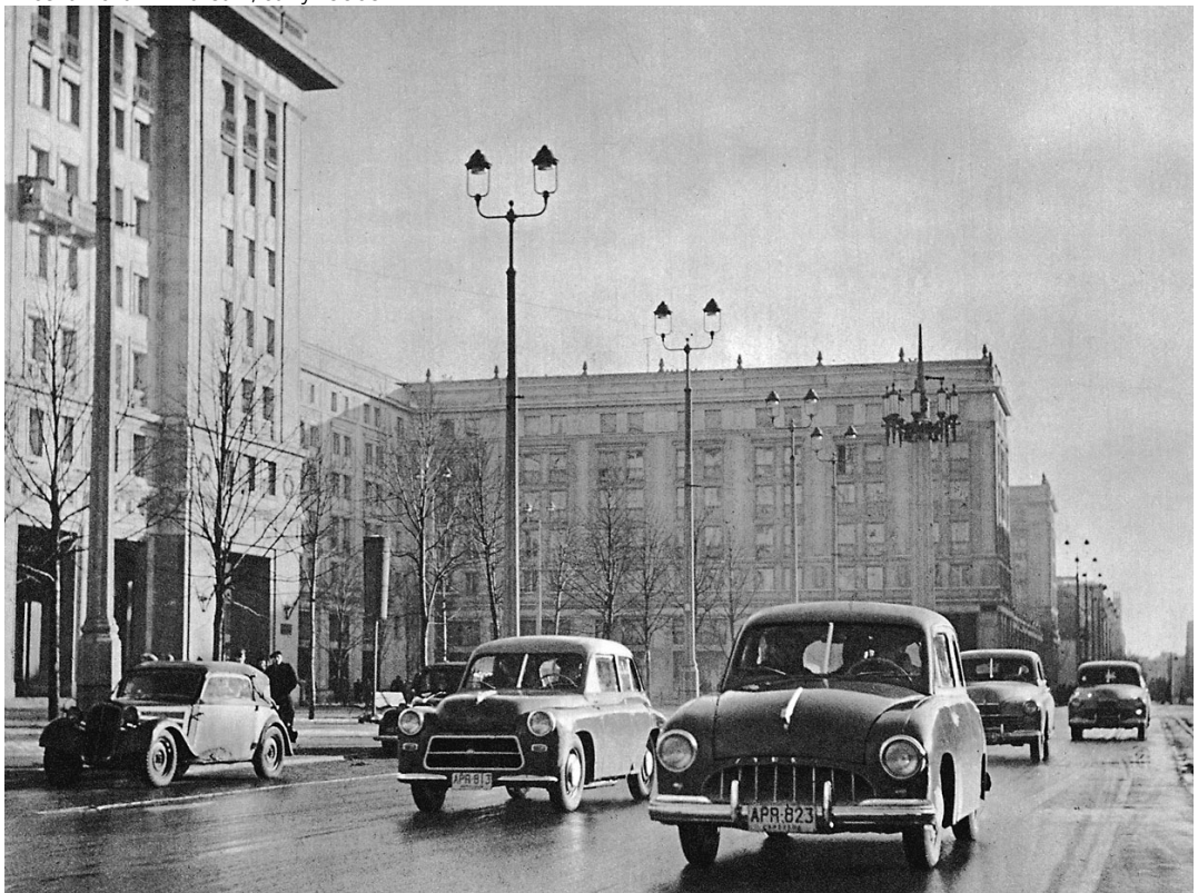
Marshalkovska Dzielnica Mieskaniova in Warsaw.