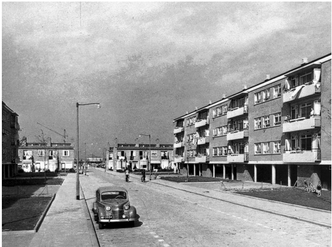
Street in Pendrecht, Rotterdam.

outcomes are obsolete, just as passé as outdated technology or conventions made obsolete by the progress of science. Architecture that aims only to be objective and scientific does not last. Unlike the tests in the laboratory, the experiment is not repeated: society evolves, the residents set new demands, reality overtakes the theoretical premises. The results slip away in time. 6