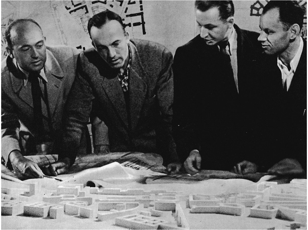
Meeting on the design and construction of the Marshalkovska Dzielnica Mieskaniova in Warsaw, early 1950s.