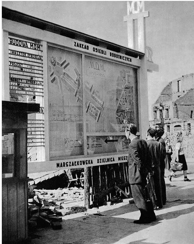
Informational billboard on the Marshalkovska Dzielnica Mieskaniova in Warsaw.