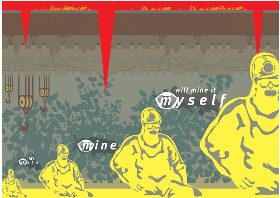
Abhishek Hazra, Mining, 'Our data are our greatest possession.'