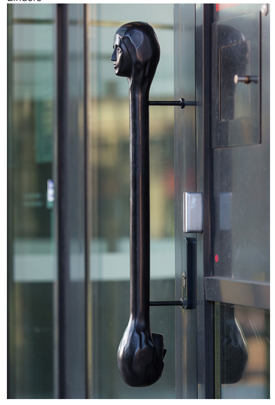
Portrait of a Recipient as a Door Handle, After a drawing produced by an anonymous philanthropist, installed at Rabobank, Blaak 333, Rotterdam, 2014, commissioned by Sculpture International Rotterdam.