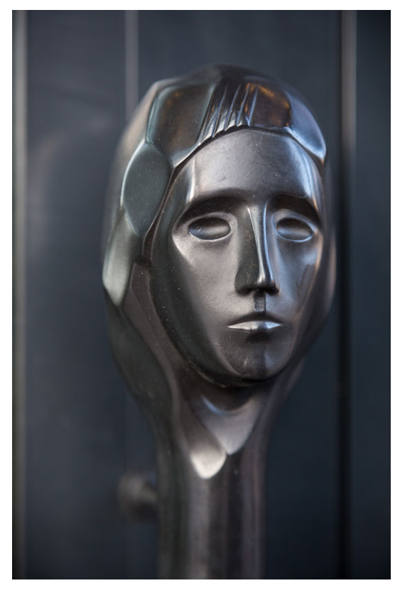
Portrait of a Recipient as a Door Handle, After a drawing produced by an anonymous philanthropist, installed at Rabobank, Blaak 333, Rotterdam, 2014, commissioned by Sculpture International Rotterdam.

Portrait of a Recipient as a Door Handle, After a Drawing Produced by an Anonymous Philanthropist takes the form of a door handle that is intended to be affixed, as standard, to the entrances of various competing banks in central Rotterdam. The first handles were installed at the Blaak 333 branch of Rabobank in February 2014.