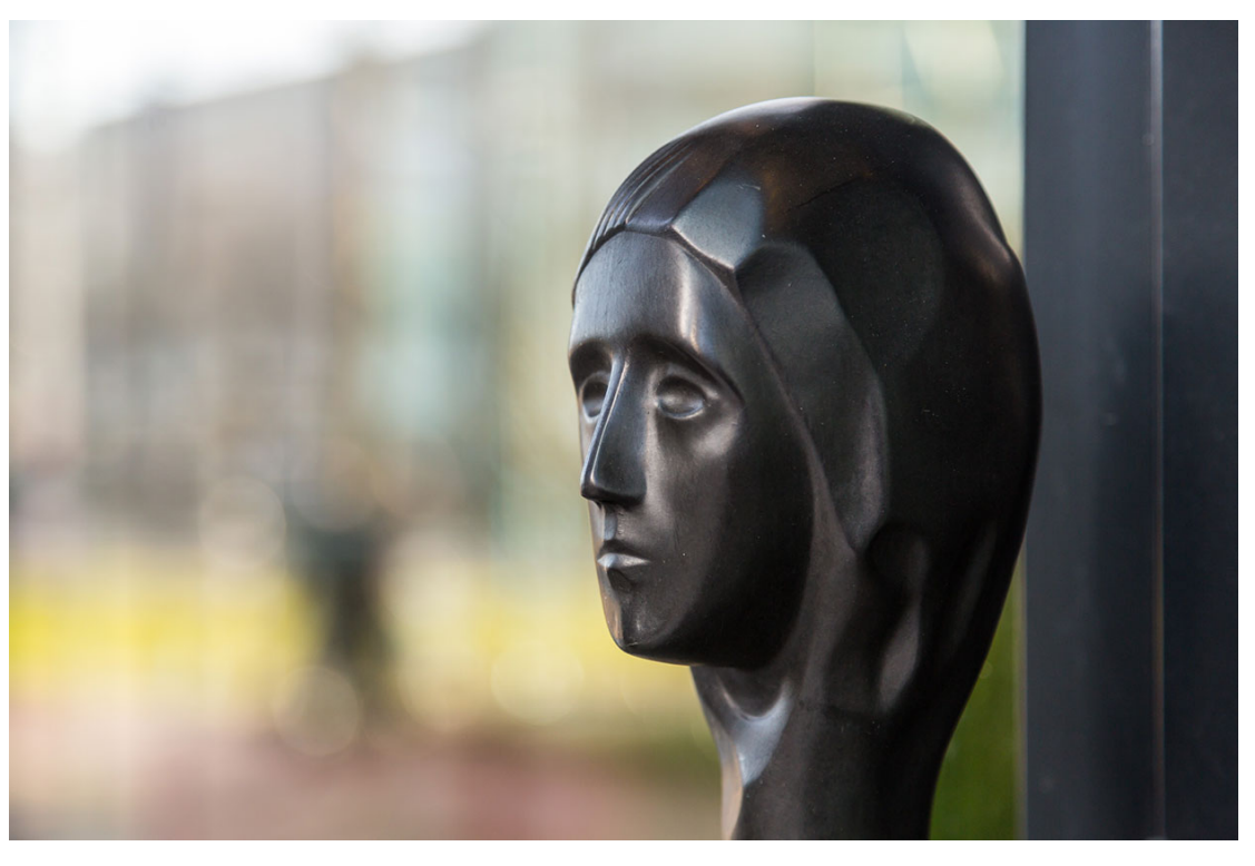
Portrait of a Recipient as a Door Handle, After a drawing produced by an anonymous philanthropist, installed at Rabobank, Blaak 333, Rotterdam, 2014, commissioned by Sculpture International Rotterdam.